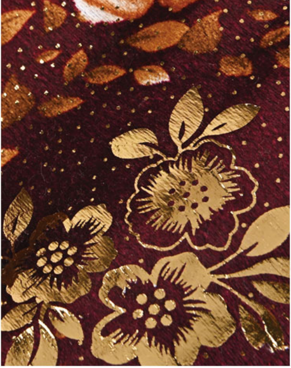
23NW-2015 Weft Knitting Gold Stamping Printed Brushed Fabric Spec: 100% Polyester, 100D/144F FDY, 130GSM, 150CM MOQ: 2500M/Color