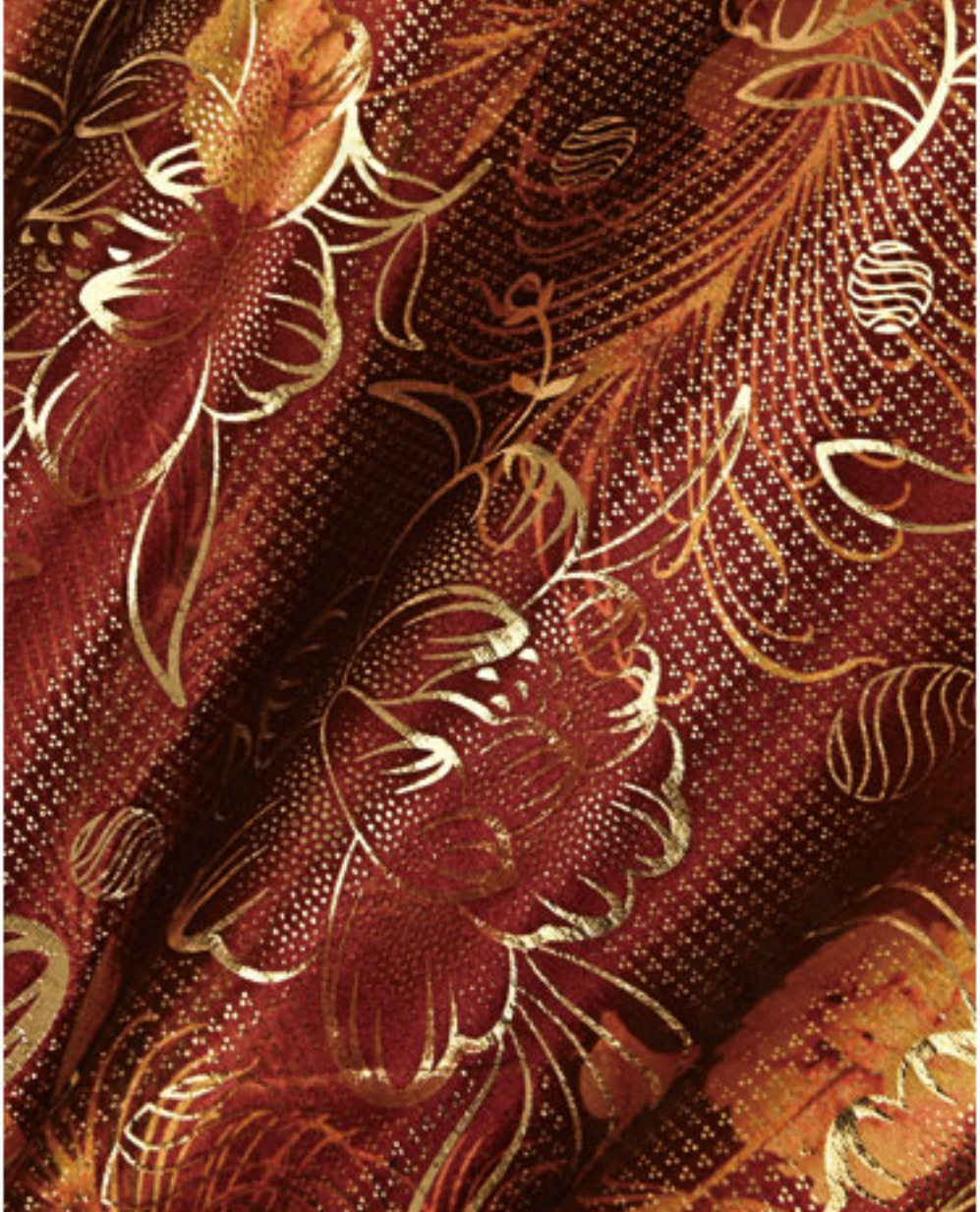
23NW-2014 Tricot Gold Stamping Printed Brushed Fabric Spec: 95% Polyester, 5% spandex, 100D/144F FDY+20D spandex, 170GSM, 150CM MOQ: 2000M/Color