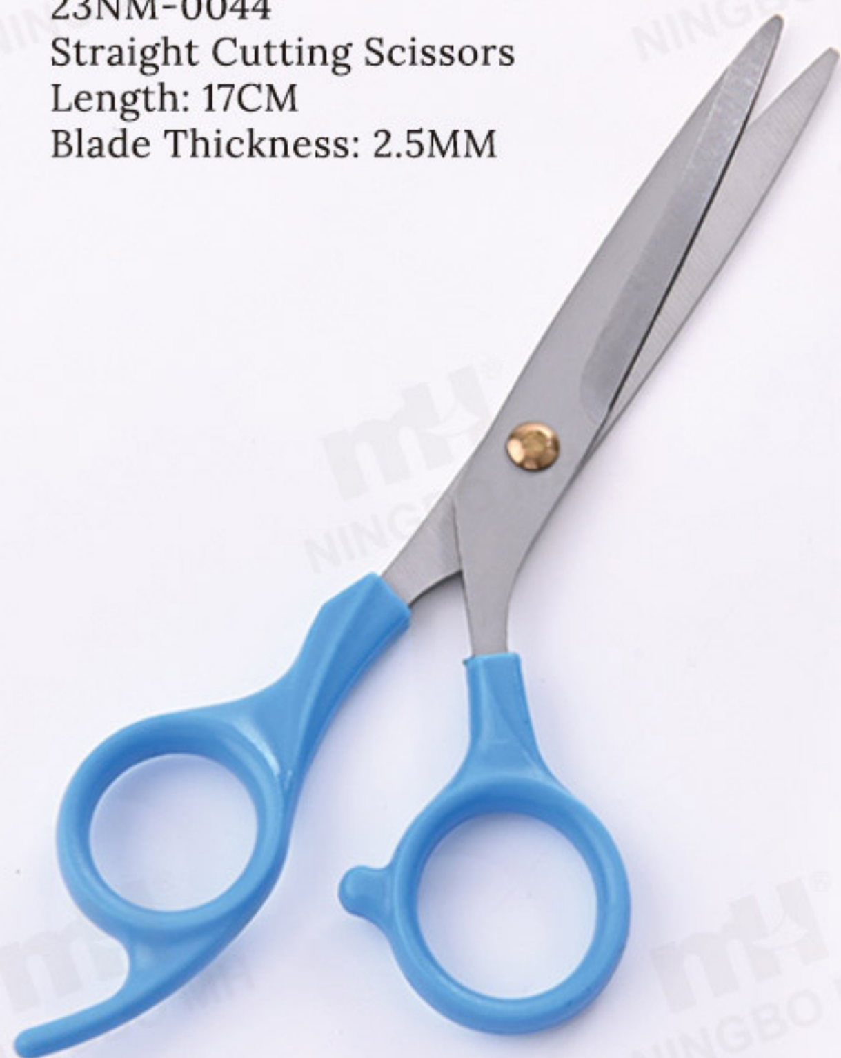
23NM-0044 Straight Cutting Scissors Length: 17CM Blade Thickness: 2.5MM