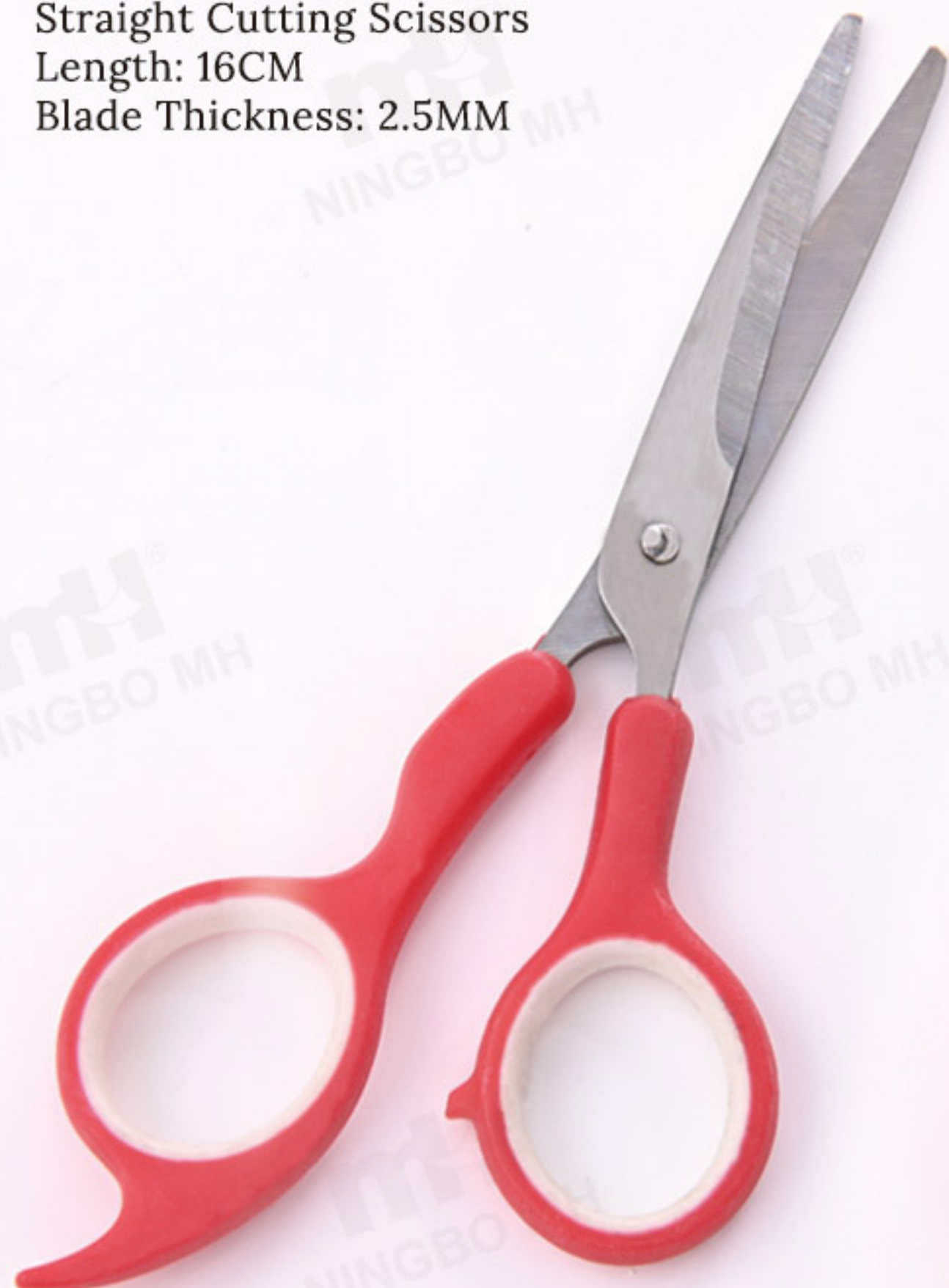
23NM-0039 Straight Cutting Scissors Length: 16CM Blade Thickness: 2.5MM