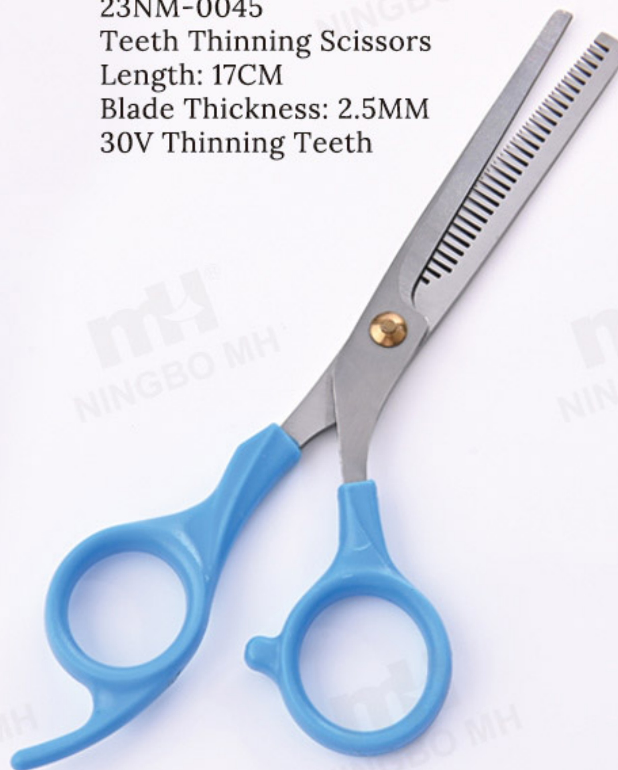
23NM-0045 Teeth Thinning Scissors Length: 17CM Blade Thickness: 2.5MM 30V Thinning Teeth