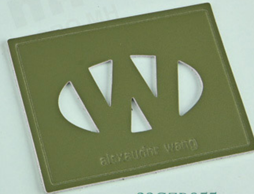
23GZB055 Size: 80*60mm