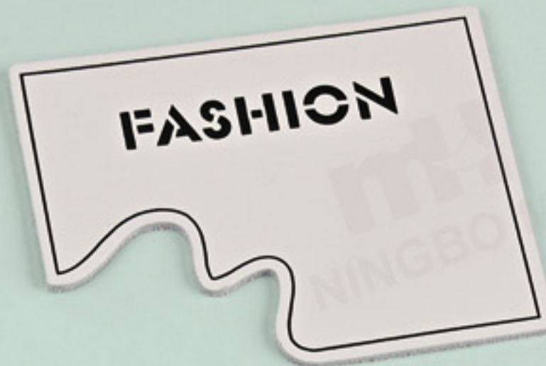
23GZB059 Size: 90*70mm