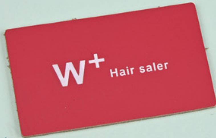
23GZB057 Size: 75*45mm