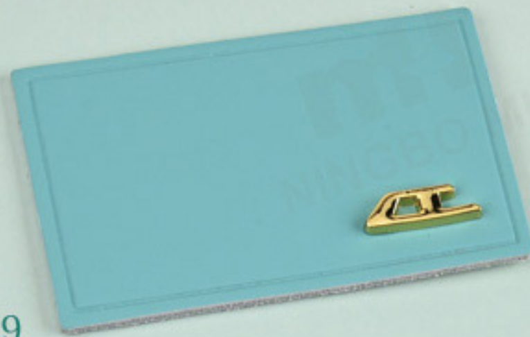
23GZB049 Size: 80*50mm