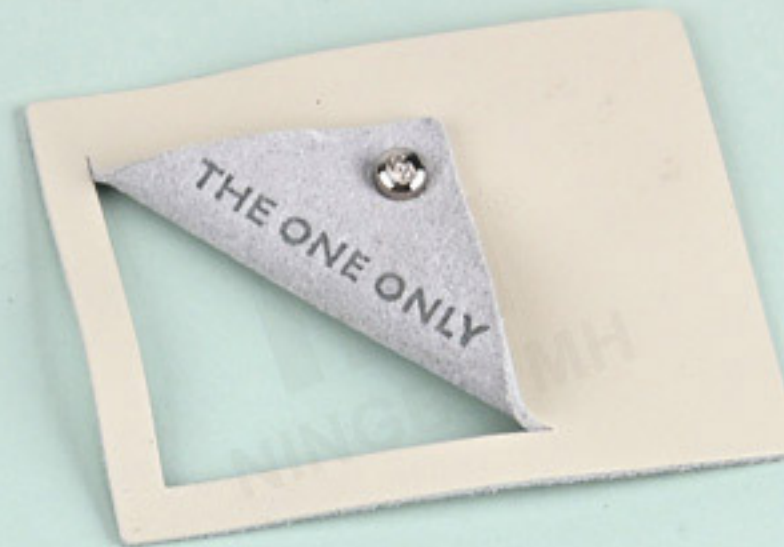
23GZB053 Size: 80*60mm