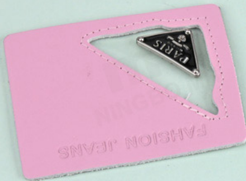
23GZB051 Size: 81*61mm