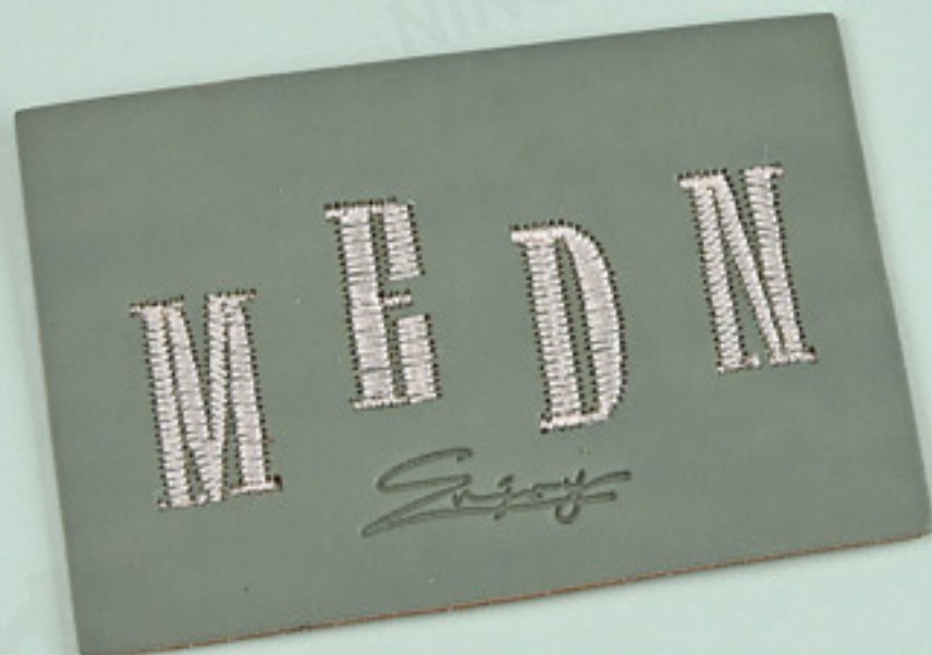
23GZB056 Size: 95*65mm