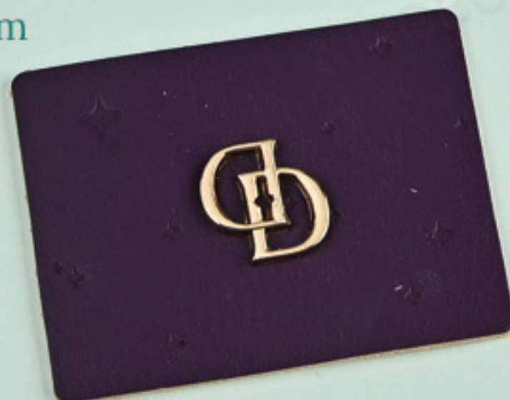
23GZB060 Size: 75*55mm