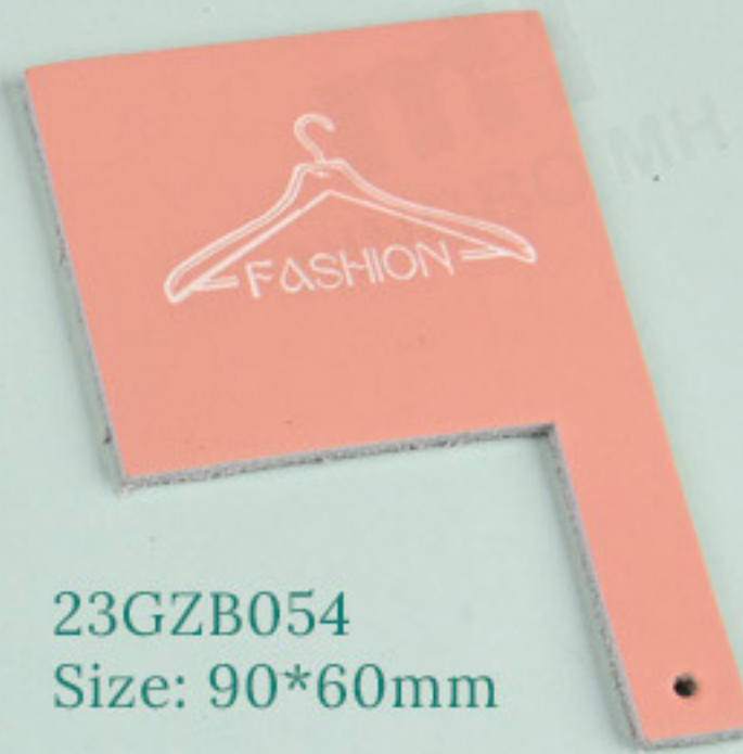
23GZB054 Size: 90*60mm