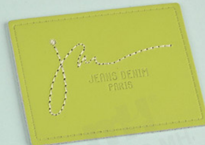
23GZB048 Size: 80*60mm