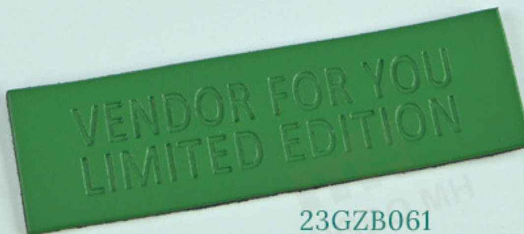
23GZB061 Size: 105*30mm