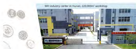
MH industry center in Hunan, 220,000m 2 workshop