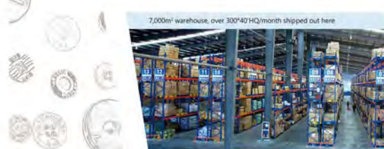
7,000m 2 warehouse, over 300*40 HQ/month shipped out here