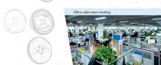
Office-sales team working