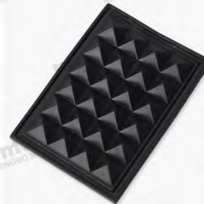
7499-0103, Size: 72*53mm