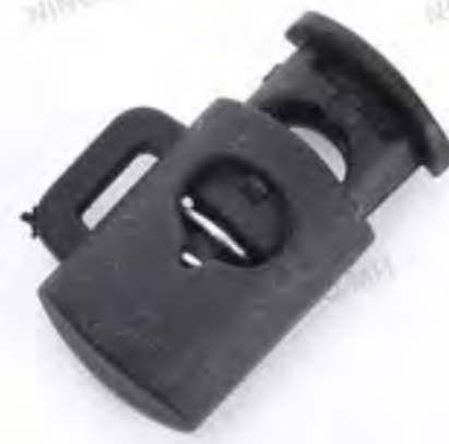
21NB-6771 Size: 23*15mm