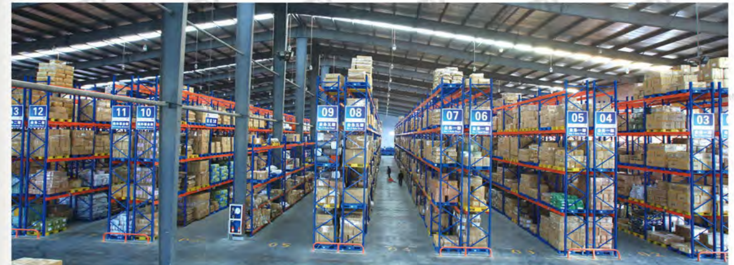
▲ 7,000m 2 warehouse, over 300*40'HQ/month shipped out here