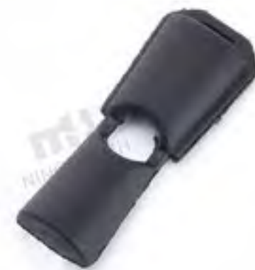
6662-0054B Size: 35*13mm