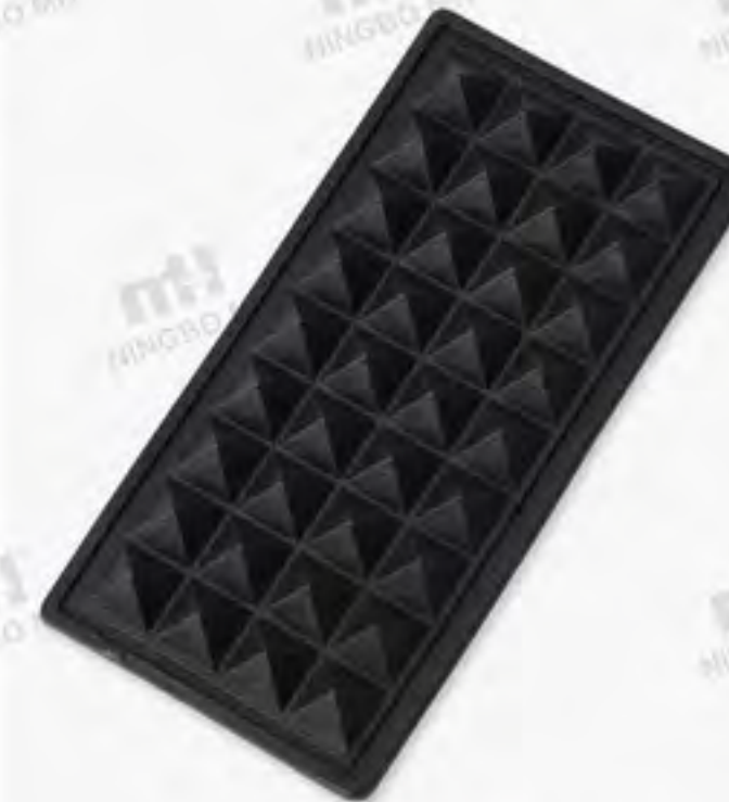
7499-0104, Size: 105*52mm