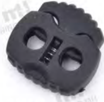
6662-0185 Size: 20*21*8.5mm