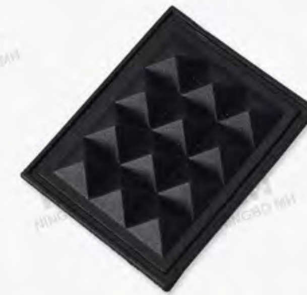
7499-0097, Size: 30*40mm