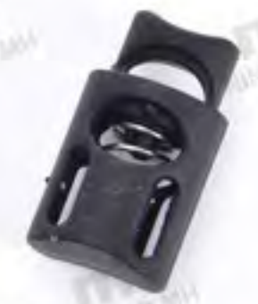
21NB-6760 Size: 18*10mm