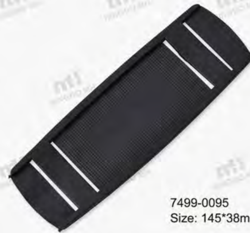
7499-0095 Size: 145*38mm