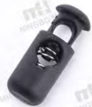
21NB-6750 Size: 20*8mm