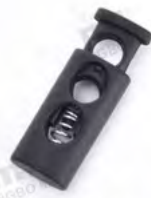
21NB-6769 Size: 28*10mm