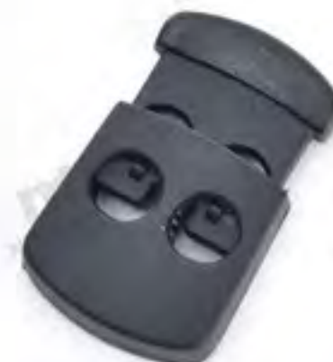
21NB-6789 Size: 30*18mm