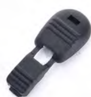
6662-0014 Size: 37.5*15mm