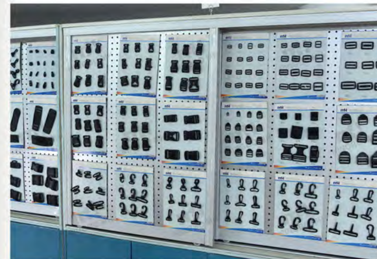
▲ plastic Buckle displaying in 2,000m 2 showroom