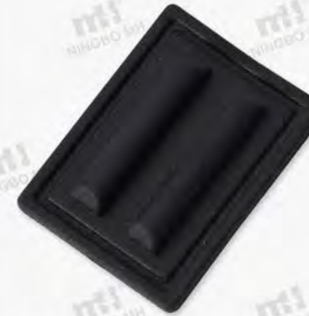
7499-0100, Size: 40*30mm