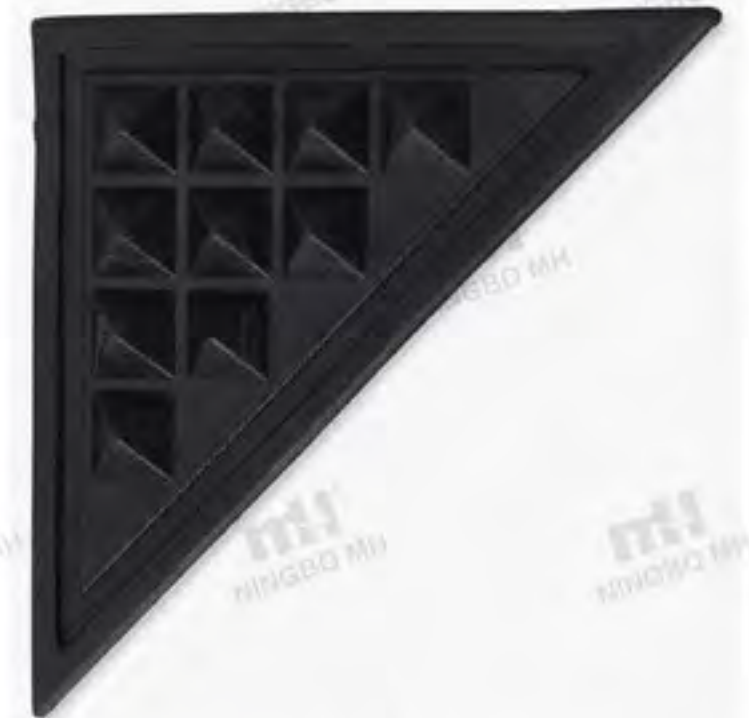
7499-0101, Size: 100*50mm