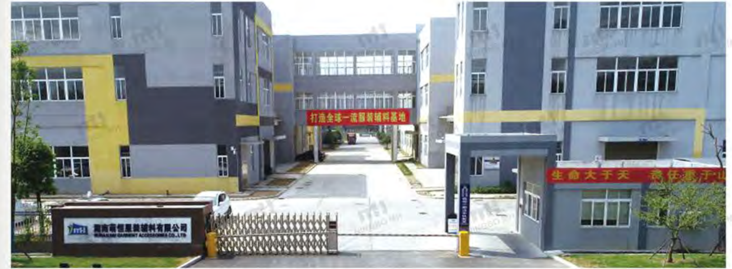
▲ MH industry center in Hunan, 220,000m 2 workshop

MH sincerely appreciates the trust of customers, would adhere to the principle of customer first, supply customers with full-category, reasonable price, on-time delivery, suitable-quality garment accessories and fabrics products.