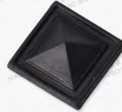
7499-0102, Size: 25*25mm