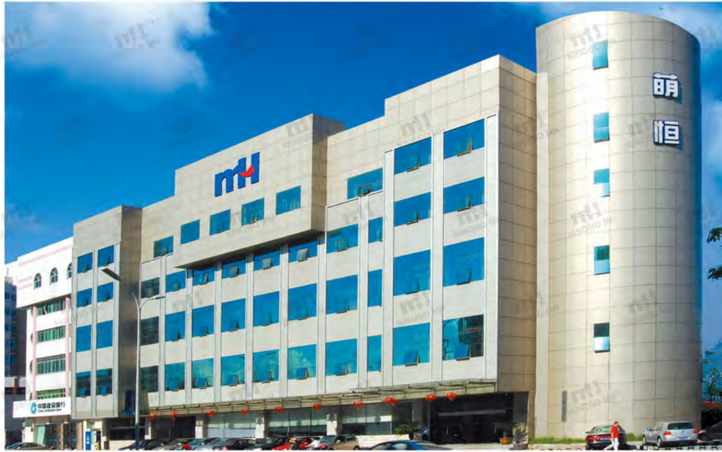
MH office building, business center for 500 sales and assistants.

Ningbo MH was established in 1999, specialized in garment accessories and fabrics. After 22 years of development, MH has set up strong business relationship with more than 120 countries, sales amount up to $640 million in 2021. MH is one of the top suppliers for garment accessories and fabrics in China. Main products include sewing thread, embroidery thread, zipper, ribbon & tape, embroidery lace, button, interlining and other garment accessories & fabrics, like TC poplin, taffeta, pongee, T/R, mini-matt, oxford, and other fabrics.