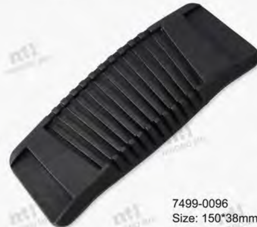
7499-0096 Size: 150*38mm