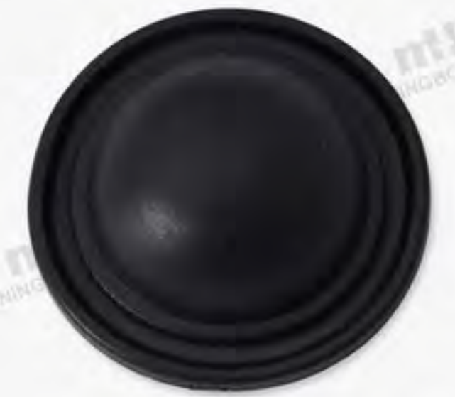
7499-0057A, Size: 40mm