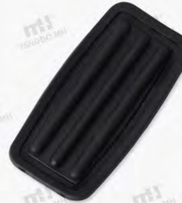
7499-0099, Size: 70*38mm