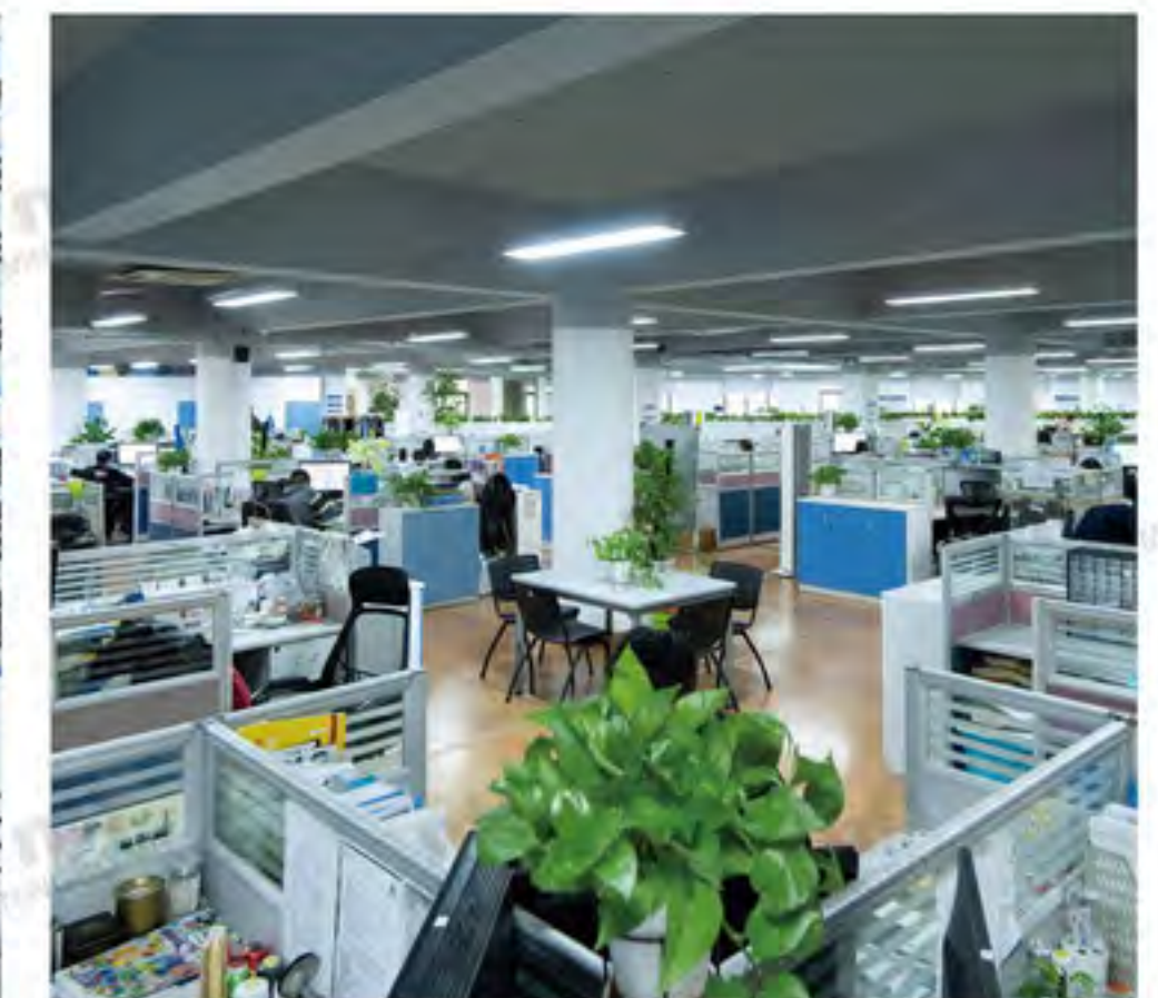
▲ Office-sales team working