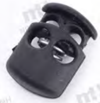
21NB-6767 Size: 18*12.5mm