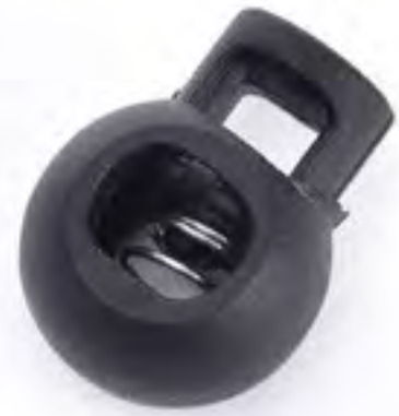
21NB-6776 Size: 22*17mm