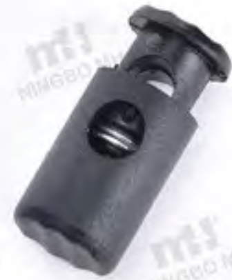
21NB-6759 Size: 26.5*12mm