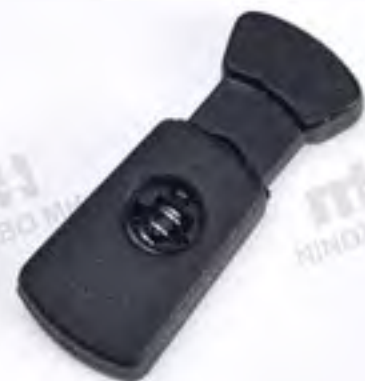
6661-0019 Size: 31*12mm