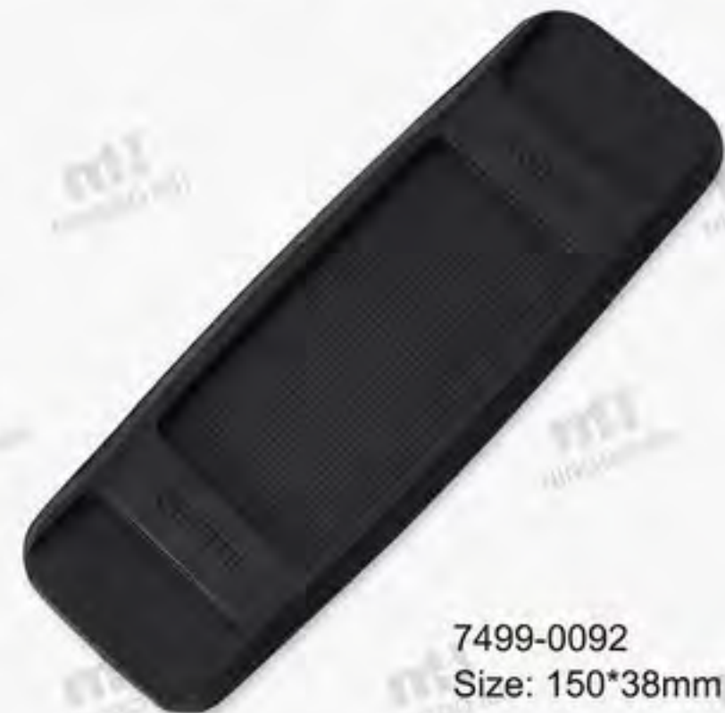
7499-0092 Size: 150*38mm