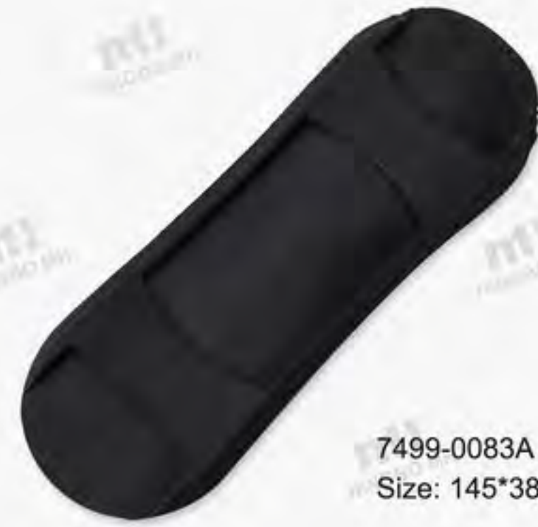
7499-0083A Size: 145*38mm