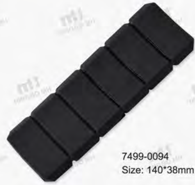
7499-0094 Size: 140*38mm