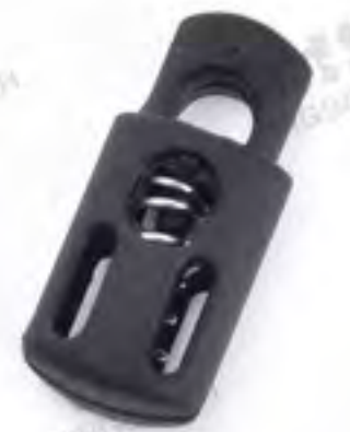
21NB-6768 Size: 27*12mm