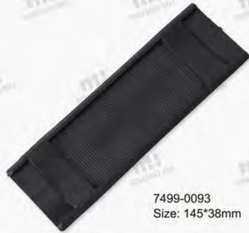
7499-0093 Size: 145*38mm