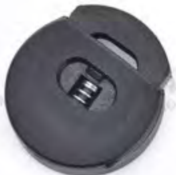
21NB-6790 Size: 24*23mm