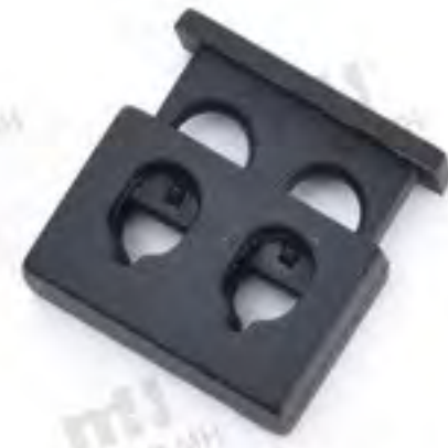
21NB-6784 Size: 18*17.5mm