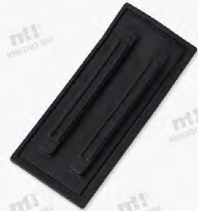
7499-0098, Size: 78*35mm