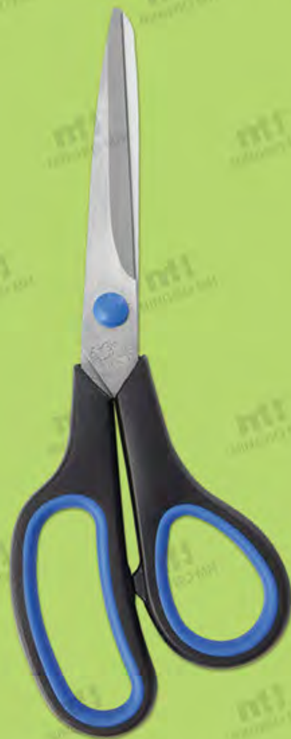
6901-5009 Size: 8.5" Thickness: 2.5mm Material: PP+TPR Handle