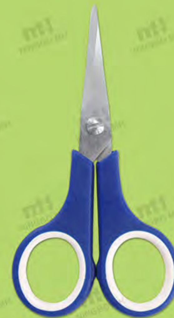
6901-5009K Size: 5.5" Thickness: 1.4mm Material: PP+TPR Handle