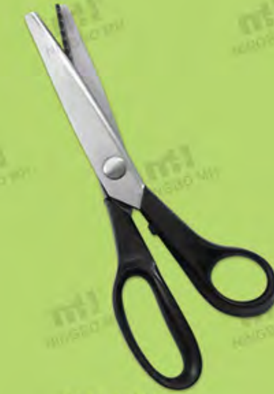
6901-3002A Size: 8.5"