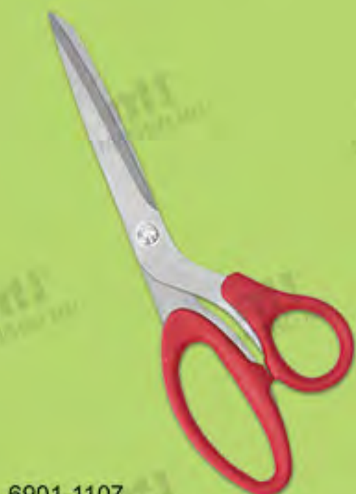
6901-1107 Size: 10" Thickness: 3.0mm Material: PP+TPR Handle