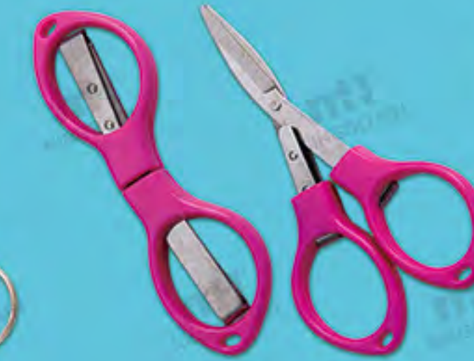
6901-9036 Size: 3.5"