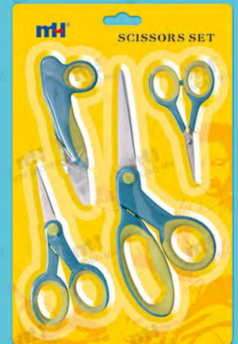
6901-6009 Size: 4"+5"+8"+5"