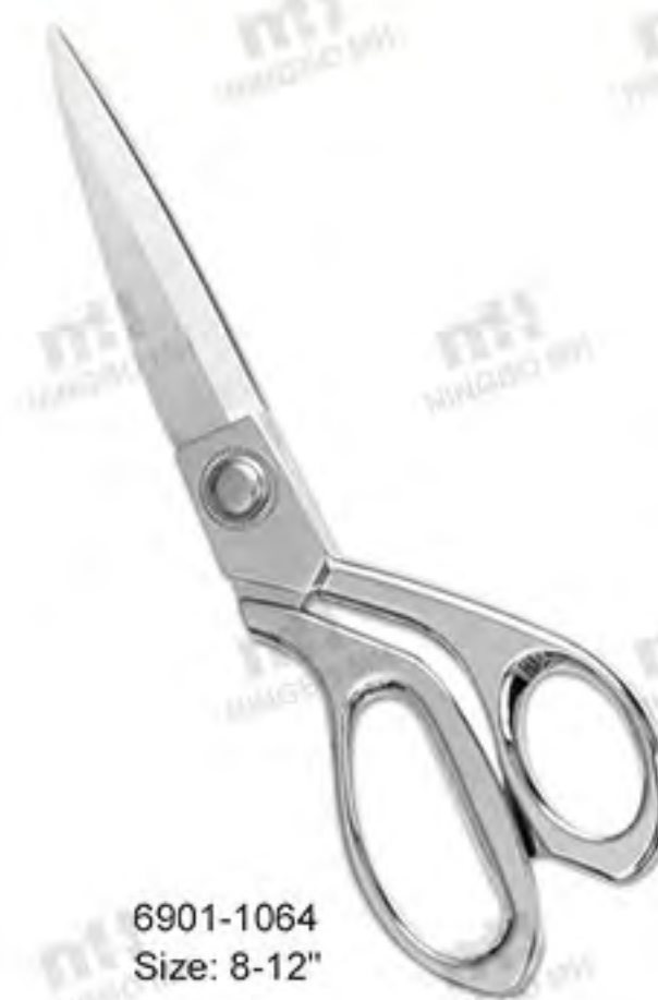
6901-1064 Size: 8-12"