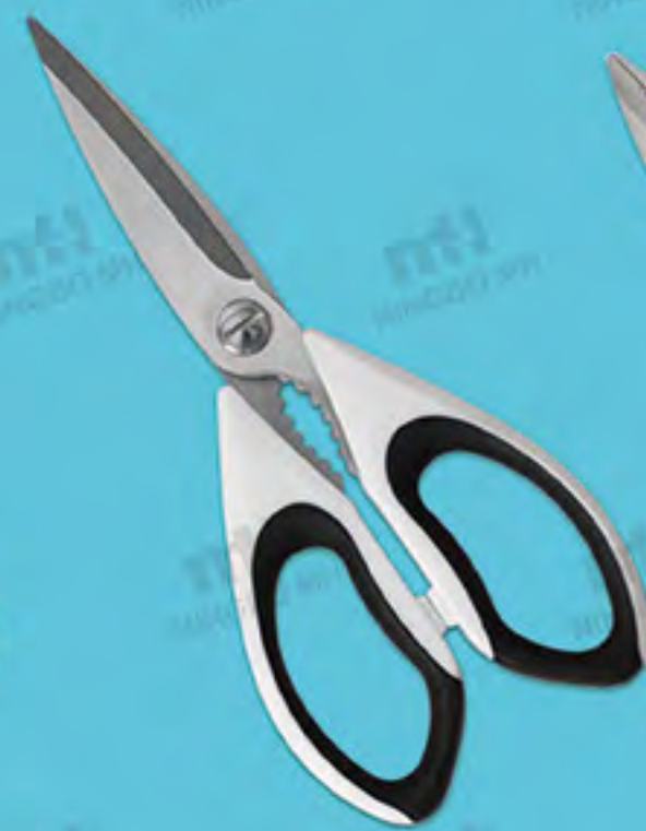
6901-9073 Size: 9"