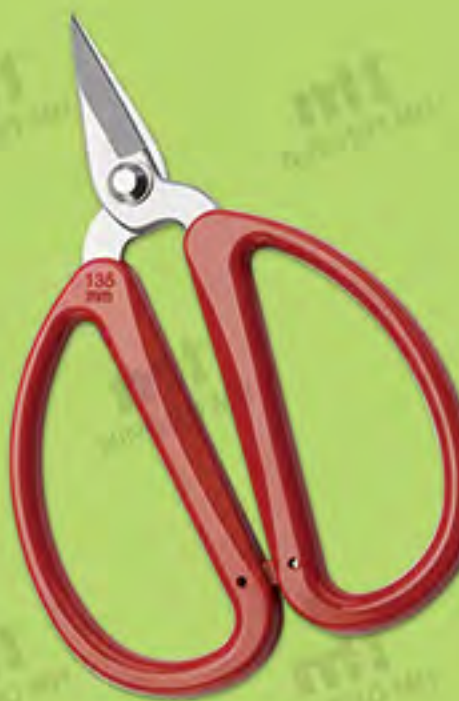
6901-9068 Size: 5.25"