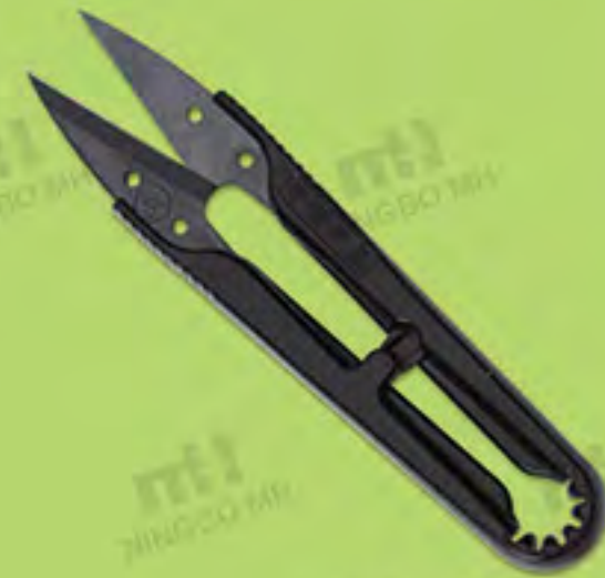
6901-4026 Size: 10.5cm