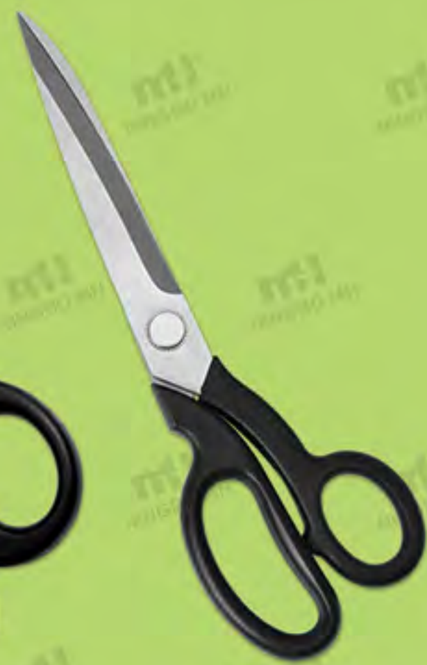
6901-1116 Size: 9.25"