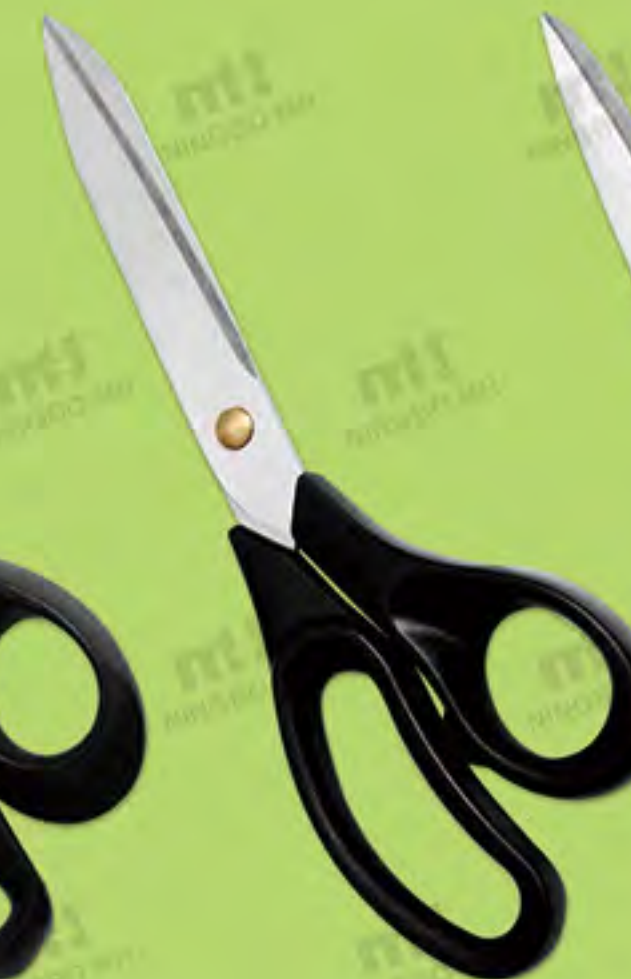
6901-1093 Size: 9.5"