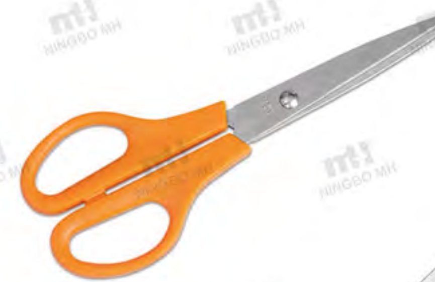
6901-5036 Size: 6"