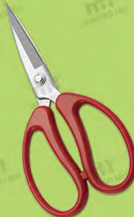
6901-9059 Size: 7.75"