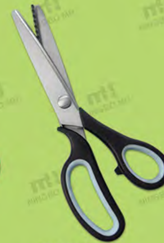
6901-3012 Size: 9"