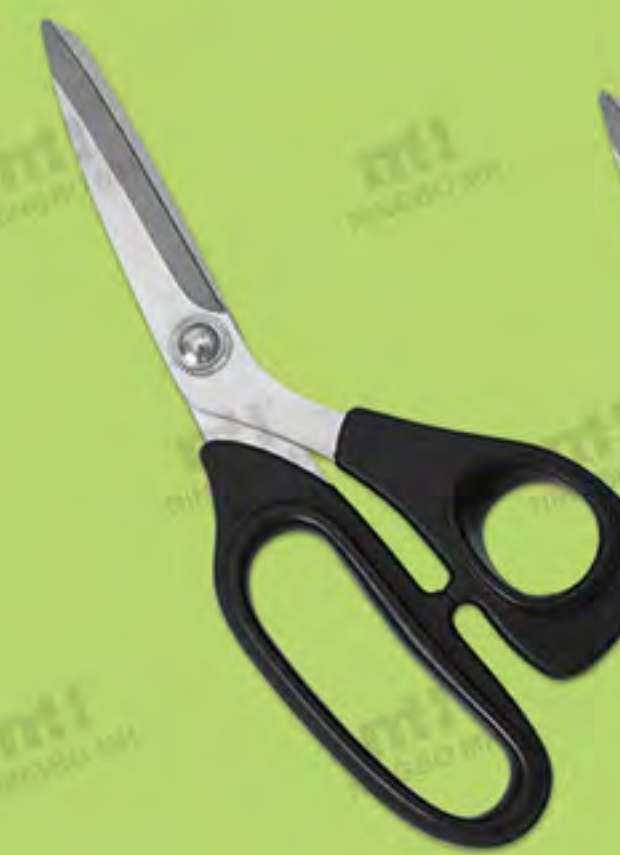
6901-1094 Size: 9" Thickness: 3.0mm Material: PP+TPR Handle