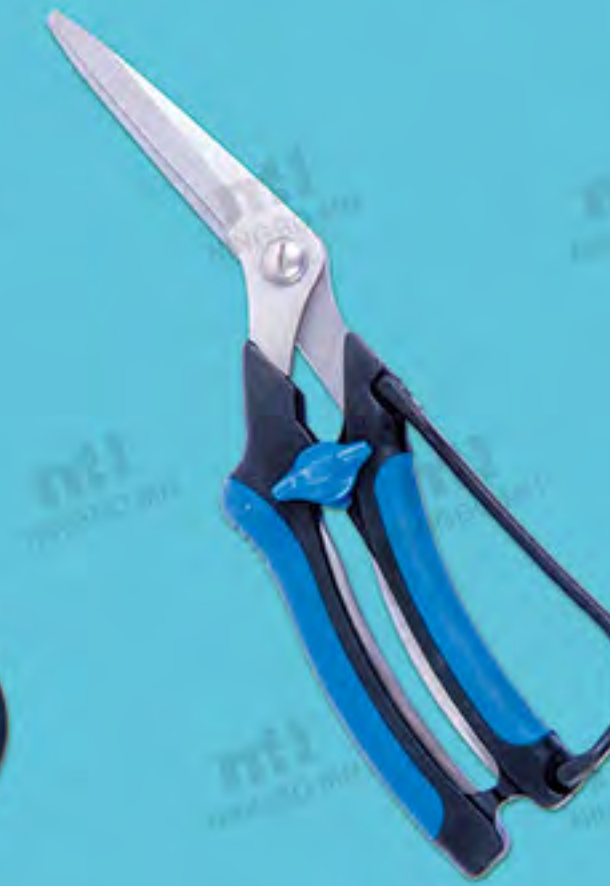
6901-9049 Size: 10"