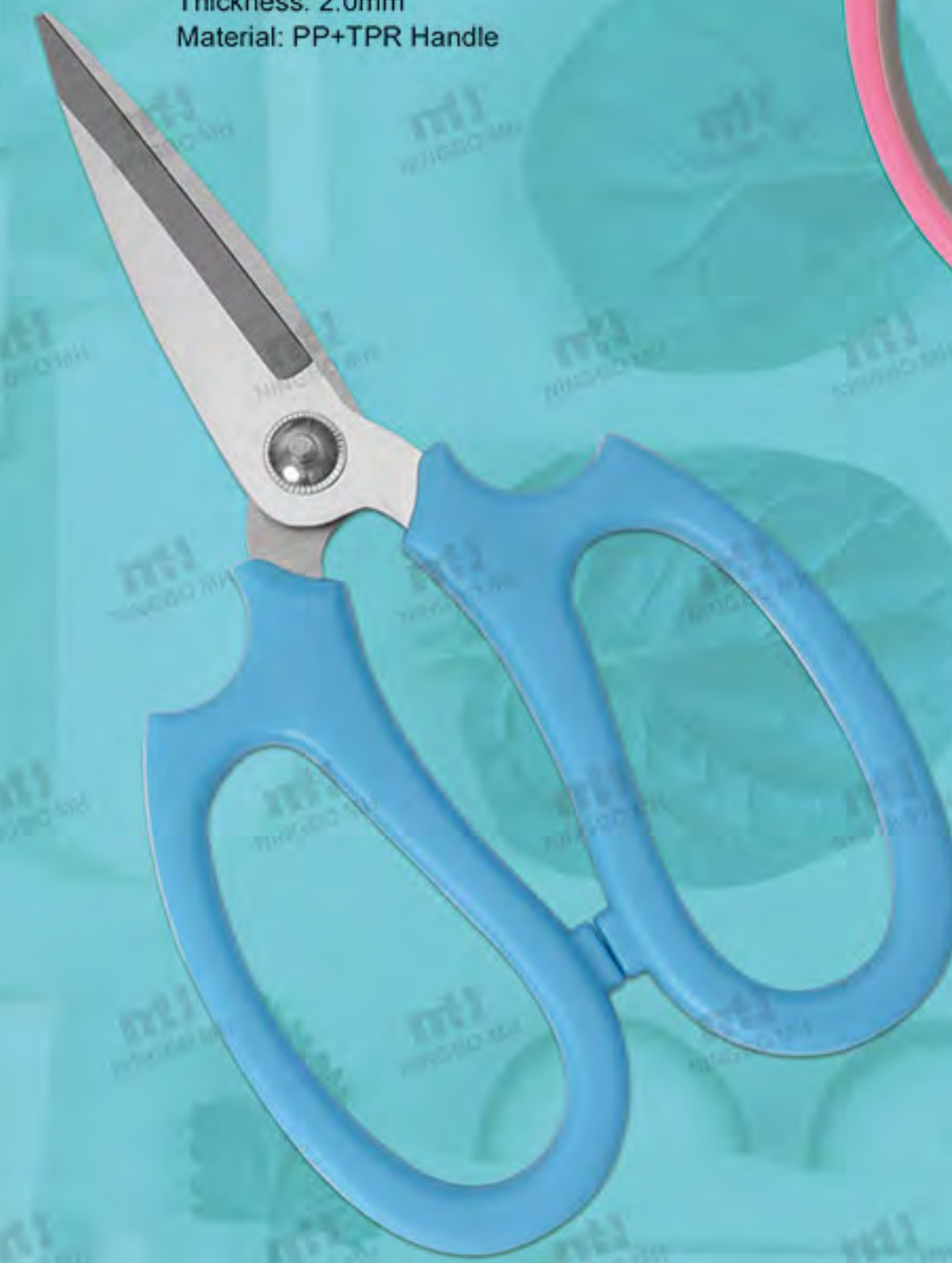
6901-9064 Size: 19cm Thickness: 2.0mm Material: PP+TPR Handle