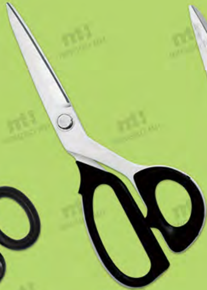
6901-1099 Size: 9-10"