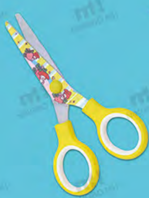
6901-9041 Size: 5"