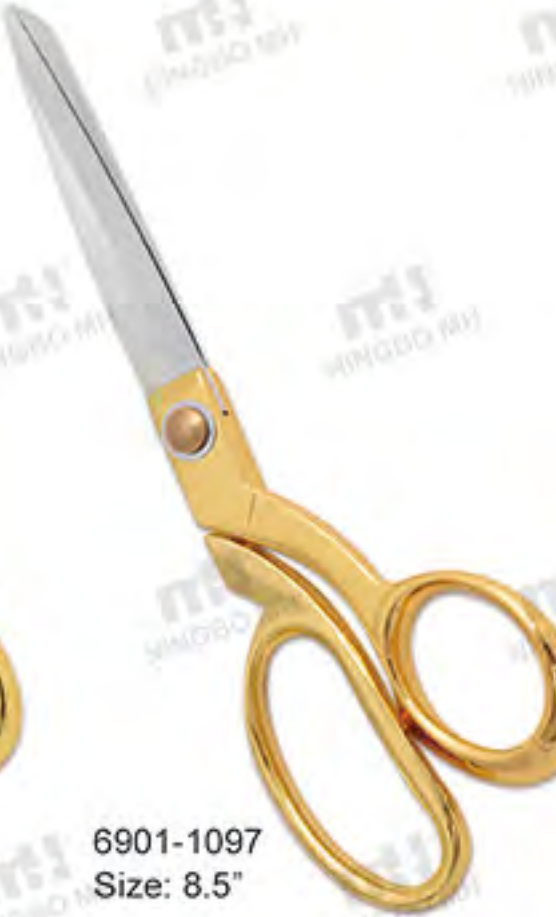
6901-1097 Size: 8.5"