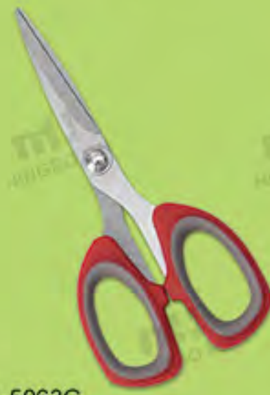
6901-5063G Size: 5.25" Thickness: 1.8mm Material: PP+TPR Handle