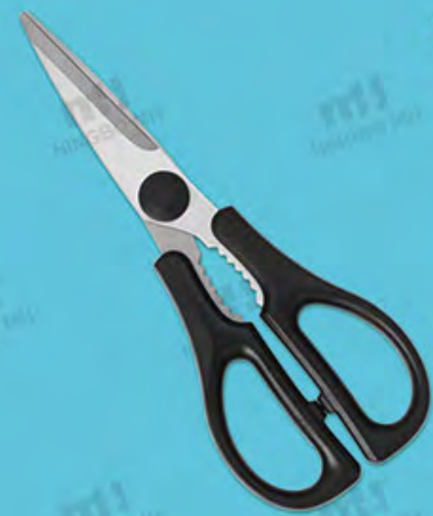
6901-9079 Size: 8"