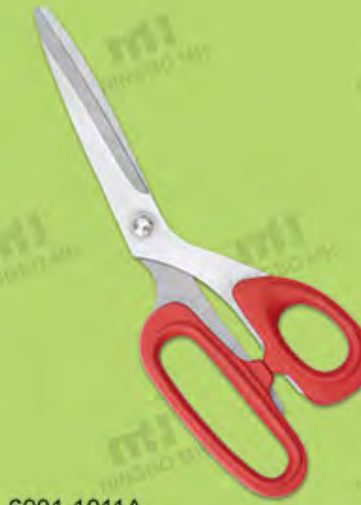
6901-1011A Size: 10" Thickness: 3.0mm Material: TPR Handle