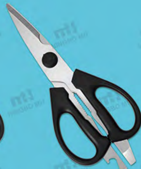
6901-9078 Size: 7.5"