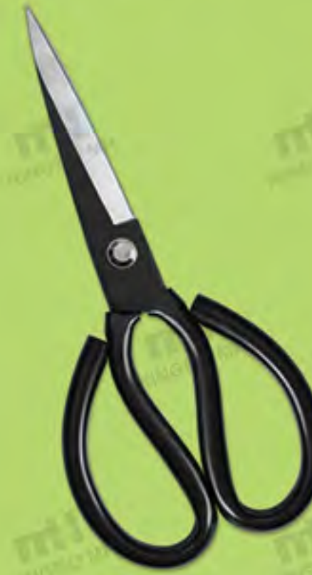
6901-9022F Size: 10.25"