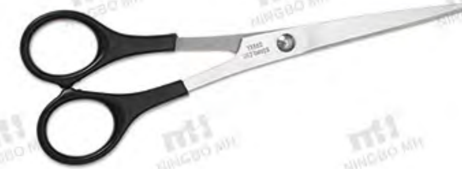
6901-9009 Size: 7"