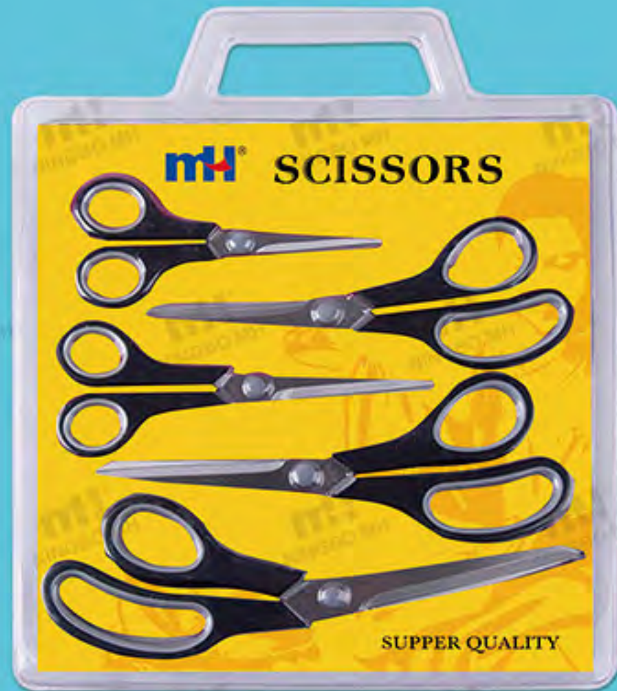
6901-6004 Size: 5.5"+6.5"+7.5"+8.5"+9.75"