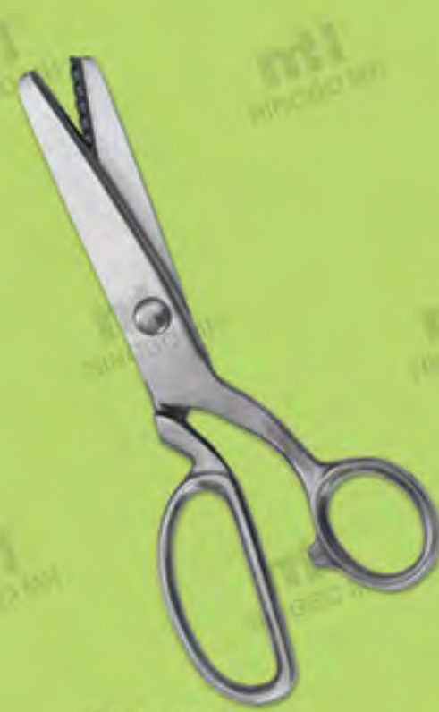
6901-3019 Size: 8.25"