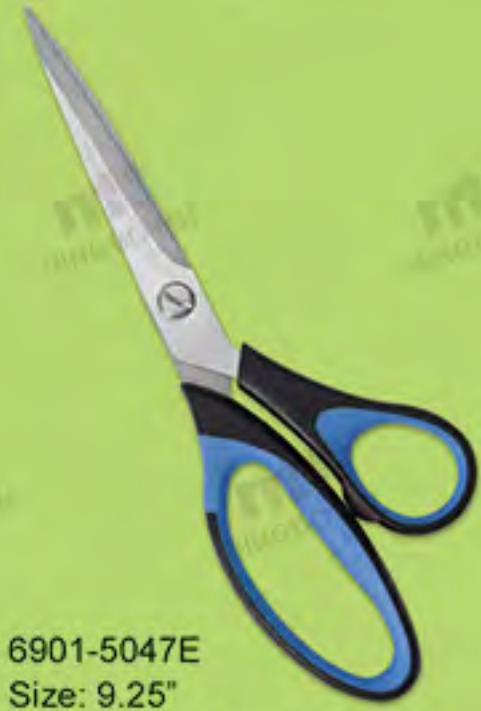
6901-5047E Size: 9.25" Thickness: 2.5mm Material: PP+TPR Handle