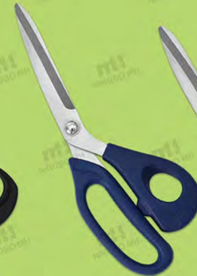
6901-1108A Size: 10" Thickness: 3.5mm Material: PP+TPR Handle