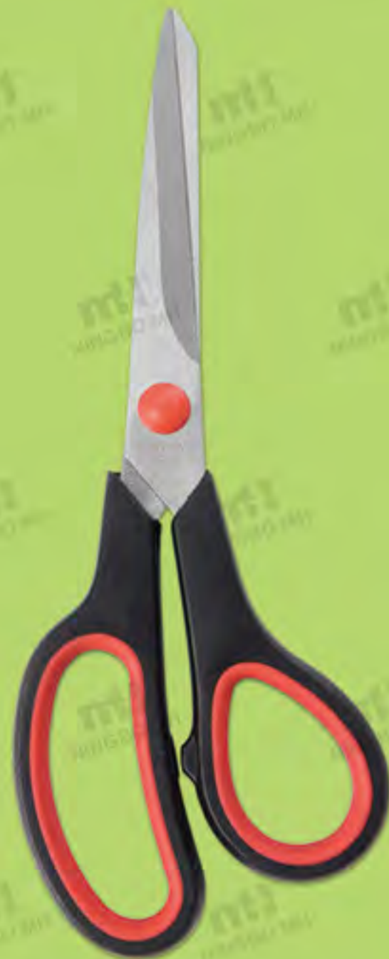
6901-5009E Size: 8.0" Thickness: 1.8mm Material: PP+TPR Handle