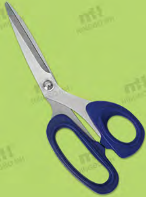
6901-1092B Size: 8.25" Thickness: 3.0mm Material: ABS Handle