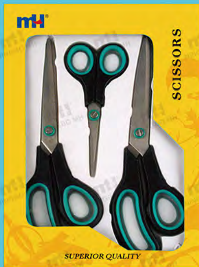
6901-6003 Size: 5.5"+8.5"+9.75"