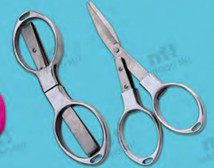
6901-9037 Size: 3.5"