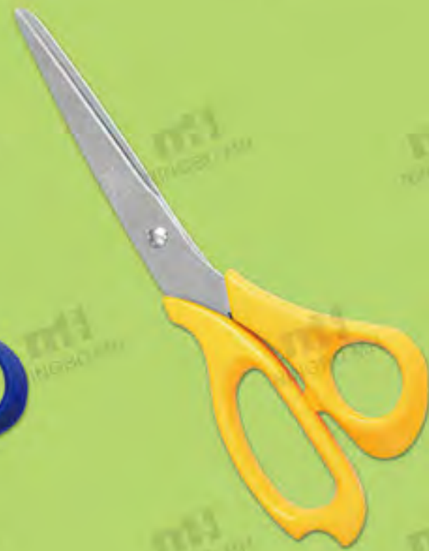
6901-5055 Size: 8.5"