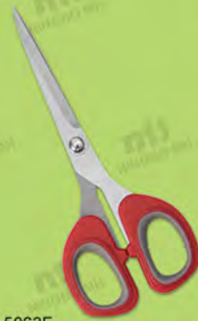
6901-5063F Size: 7.25" Thickness: 2.0mm Material: PP+TPR Handle