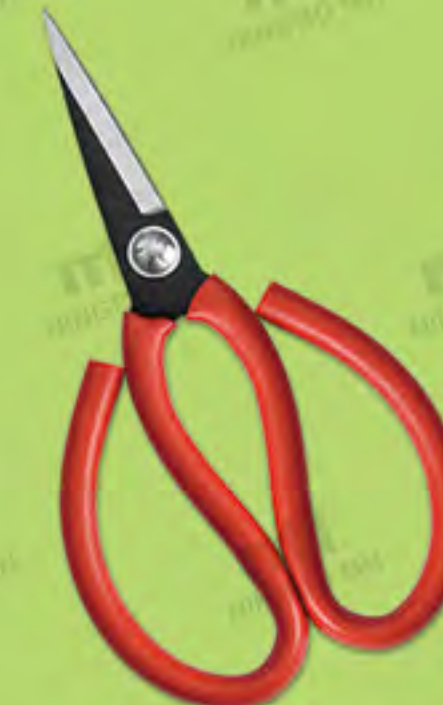
6901-9046A Size: 7.5"