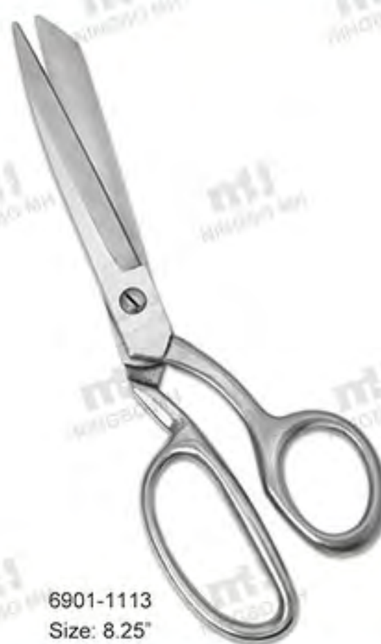
6901-1113 Size: 8.25"