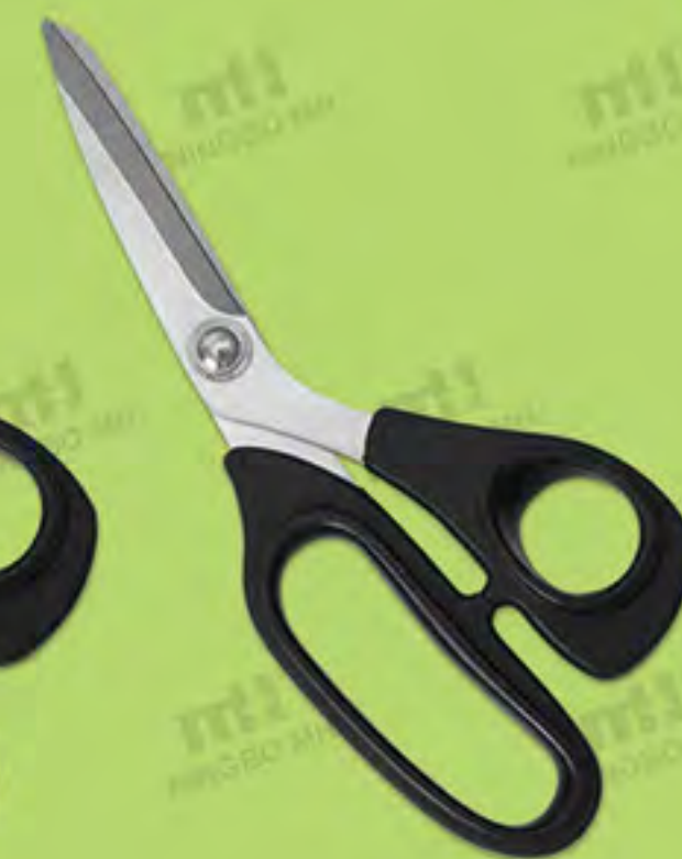
6901-1094A Size: 8.25" Thickness: 3.0mm Material: PP+TPR Handle