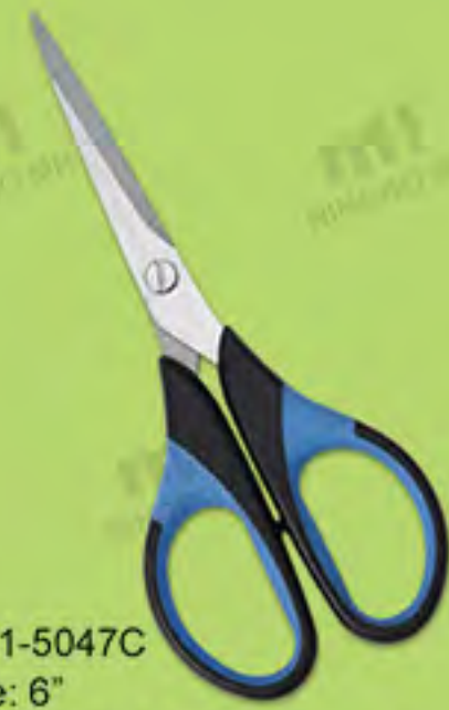
6901-5047C Size: 6" Thickness: 1.8mm Material: PP+TPR Handle