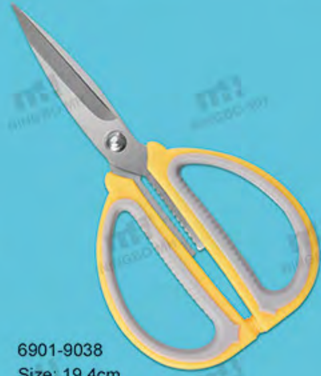
6901-9038 Size: 19.4cm Thickness: 3.0mm Material: PP+TPR Handle