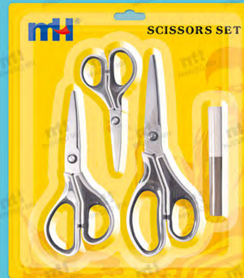
6901-6010 Size: 8"+7"+5"+4.75"