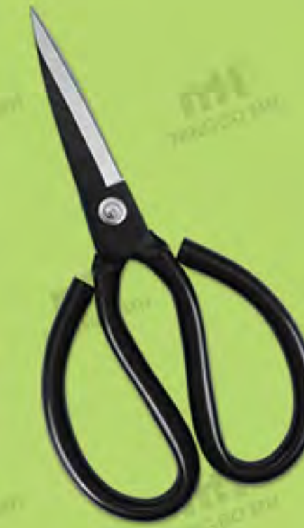
6901-9022E Size: 8.75"