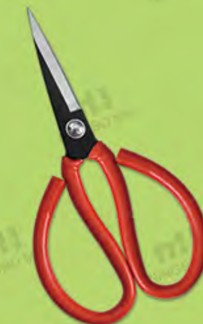
6901-9046C Size: 6.5"