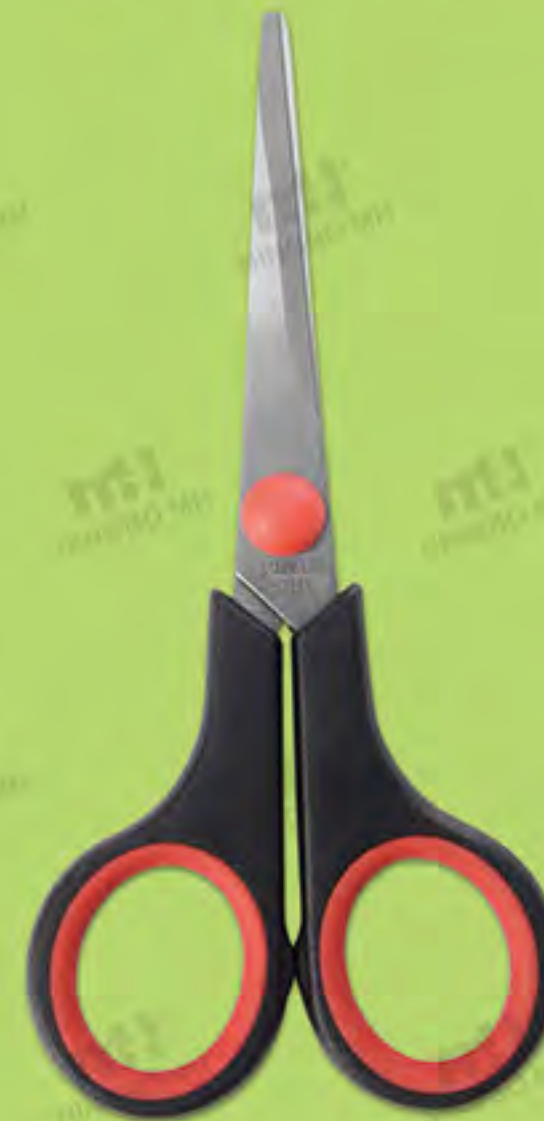
6901-5009B Size: 6.5" Thickness: 1.6mm Material: PP+TPR Handle