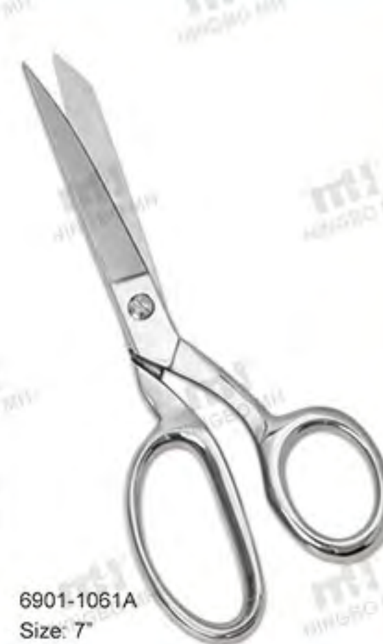
6901-1061A Size: 7"