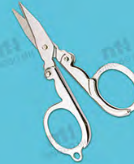
6901-9020 Size: 3"