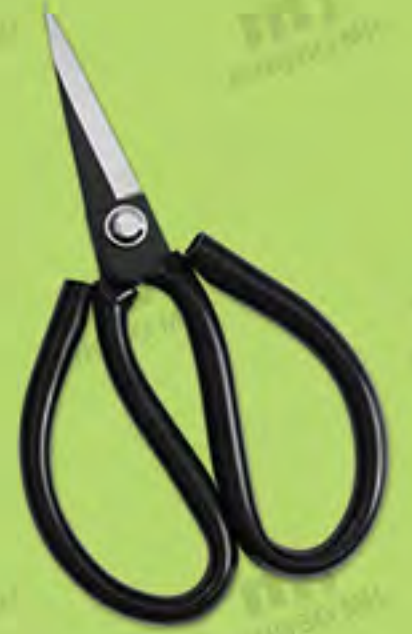
6901-9022G Size: 6.25"