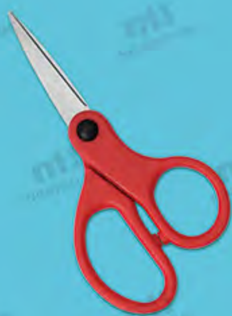
6901-9044 Size: 5"