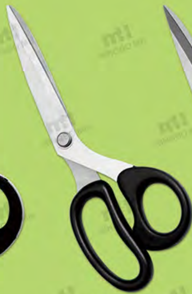
6901-1095 Size: 10"