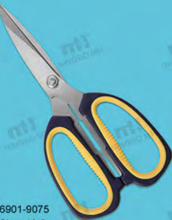
6901-9075 Size: 19.5cm Thickness: 2.3mm Material: PP+TPR Handle