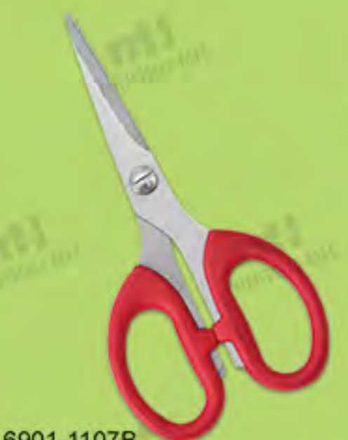
6901-1107B Size: 5.5" Thickness: 2.0mm Material: PP+TPR Handle