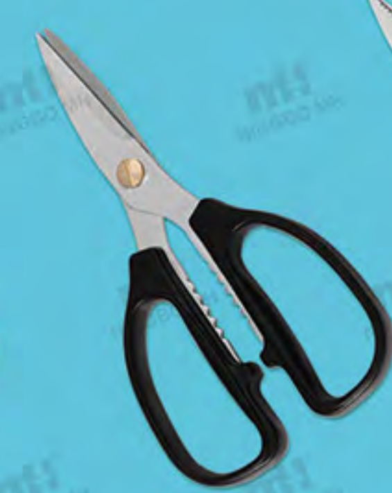
6901-9032 Size: 7"