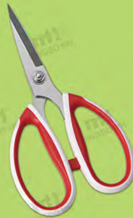
6901-9031 Size: 8"