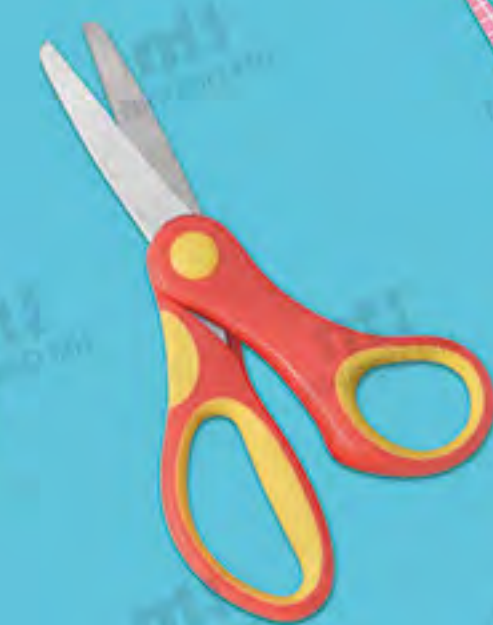
6901-9081 Size: 5"