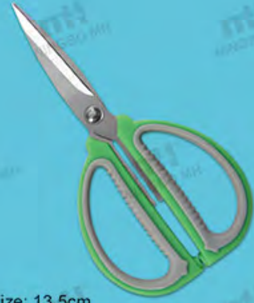
Size: 13.5cm Thickness: 1.8mm Material: PP+TPR Handle