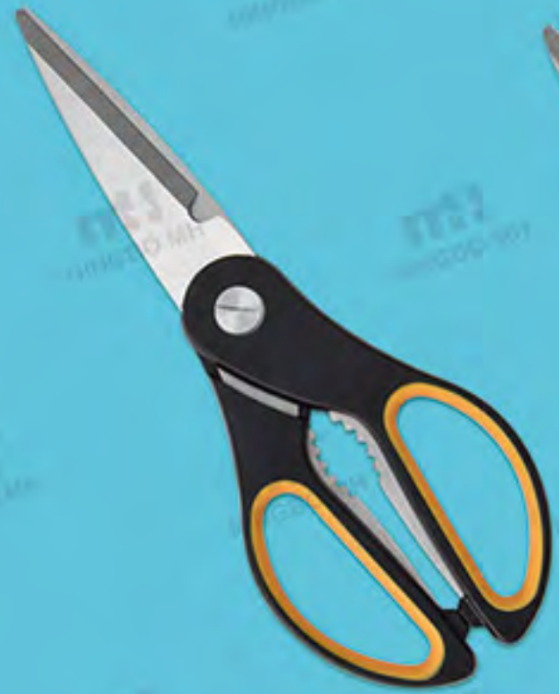
6901-9074 Size: 9.25"