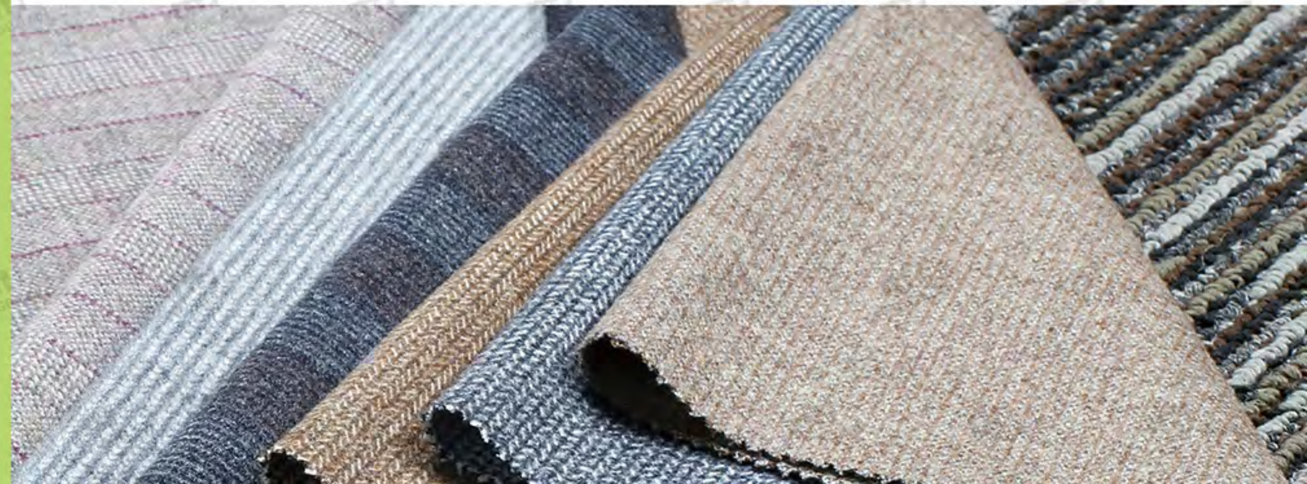
6901-1090 Size: 9.25"