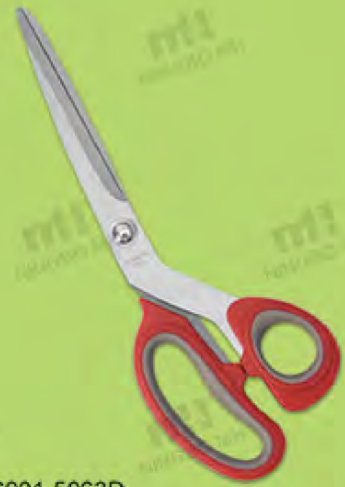
6901-5063D Size: 9.25" Thickness: 2.5mm Material: PP+TPR Handle