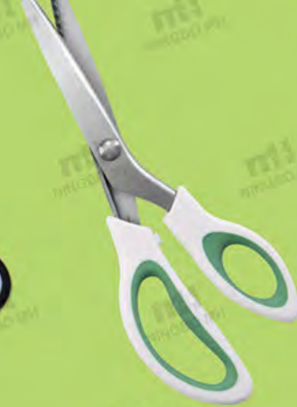
6901-3010 Size: 9.5"