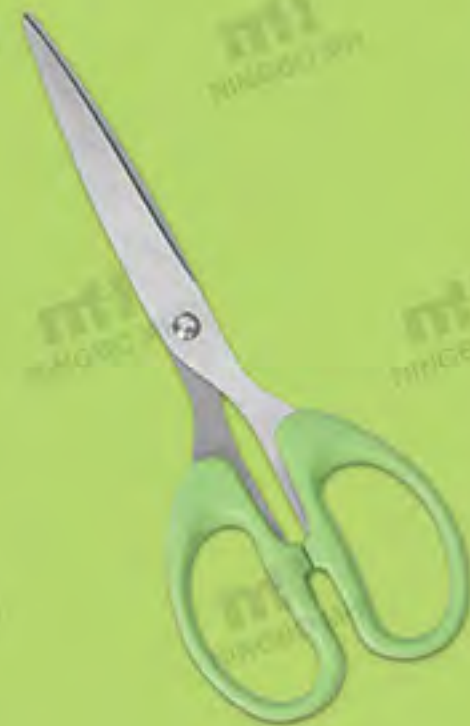
6901-5042D Size: 6.5" Thickness: 1.6mm Material: ABS Handle