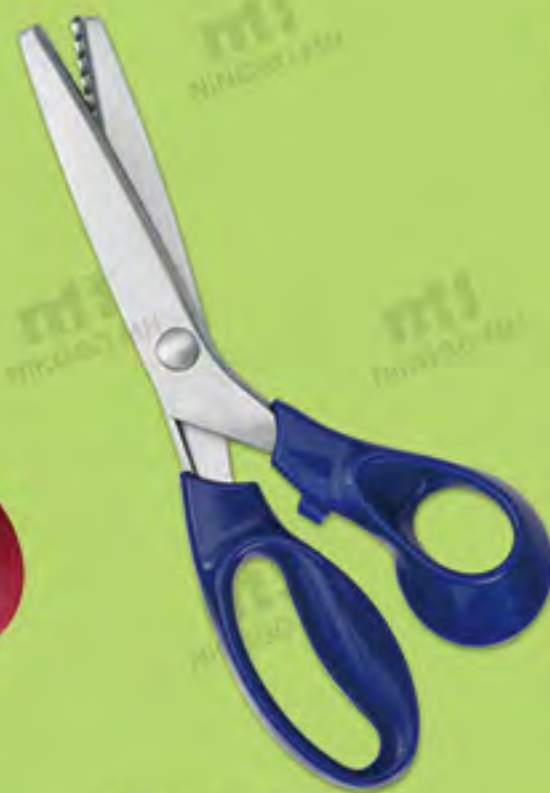
6901-3027 Size: 9"