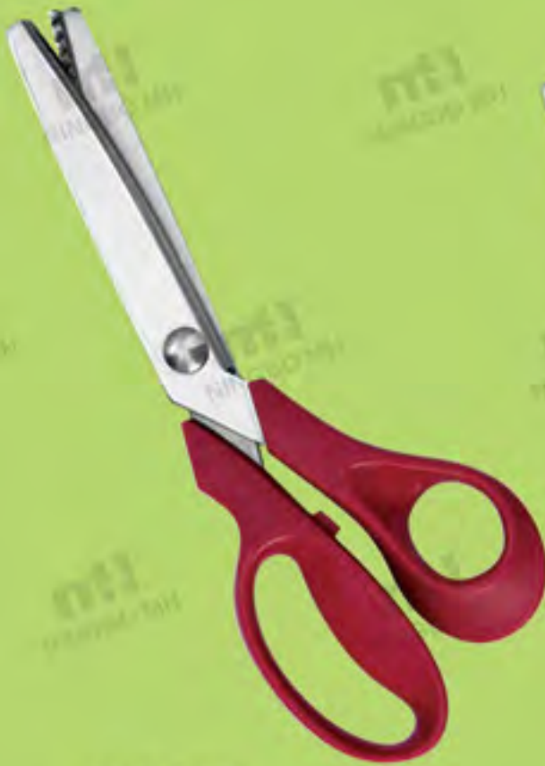
6901-3018 Size: 10"