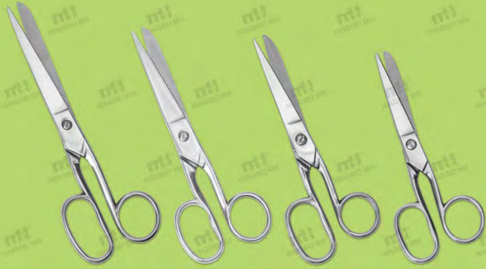
6901-5103 Size: 8"