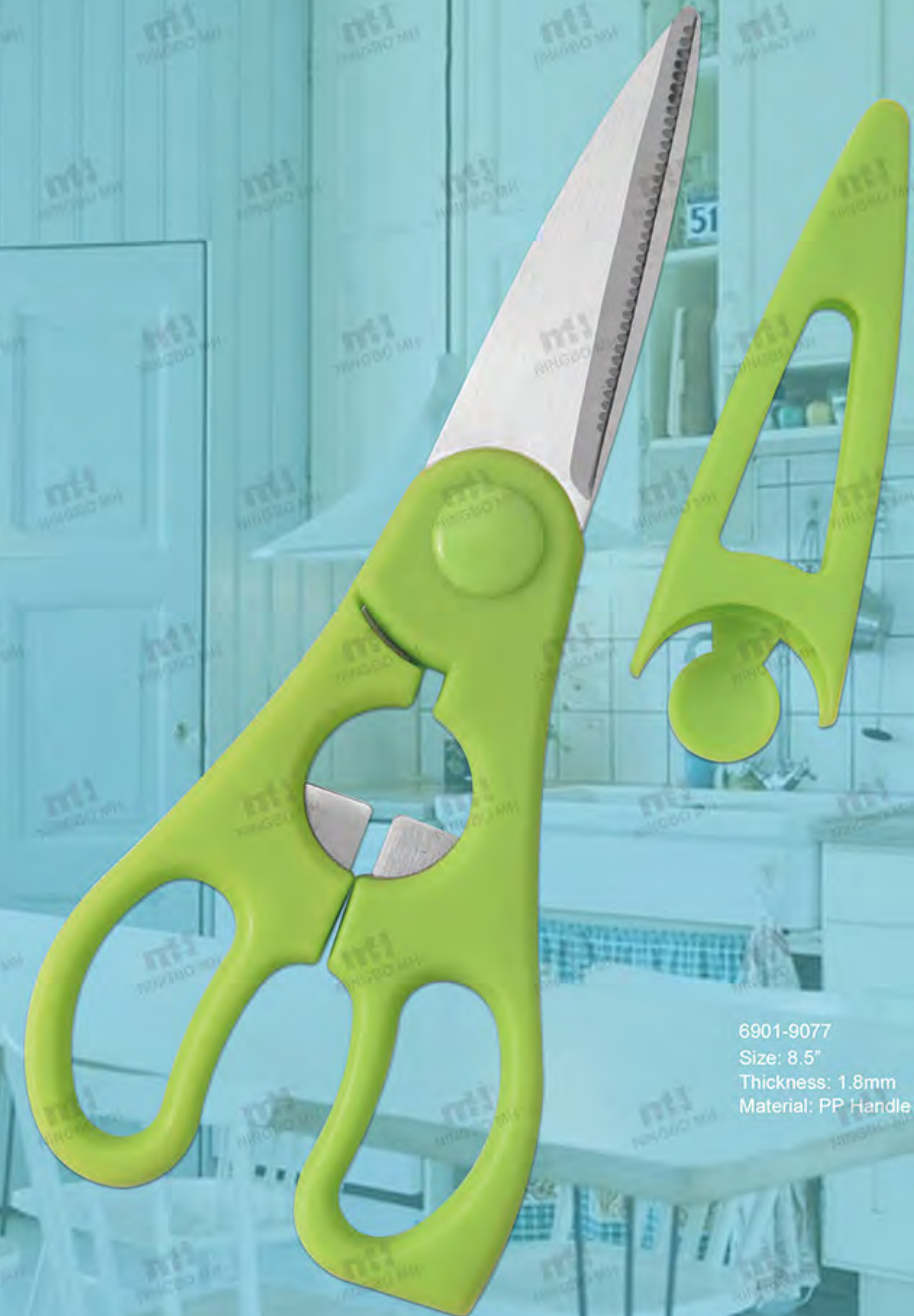
6901-9077 Size: 8.5" Thickness: 1.8mm Material: PP Handle