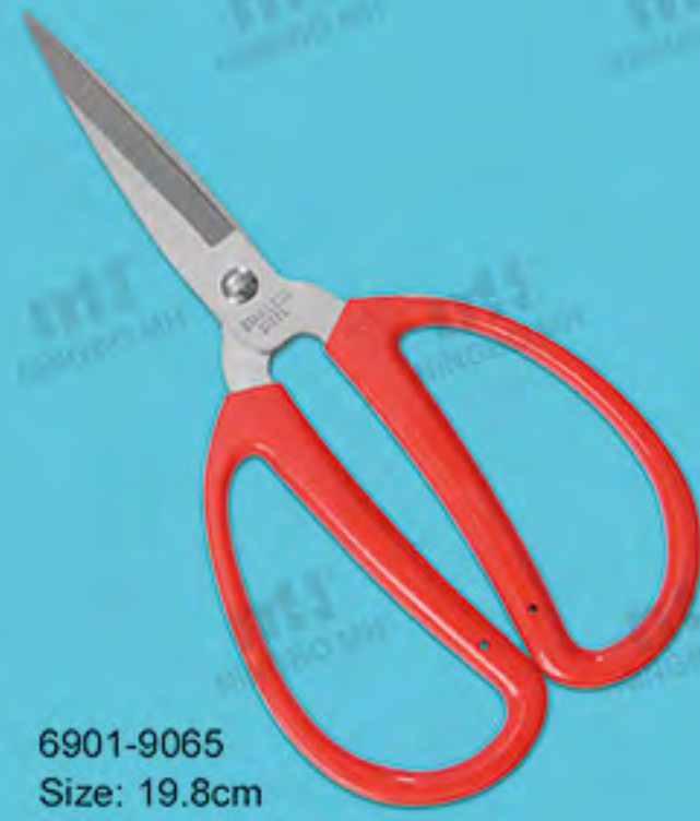
6901-9065 Size: 19.8cm Thickness: 2.3mm Material: PP Handle