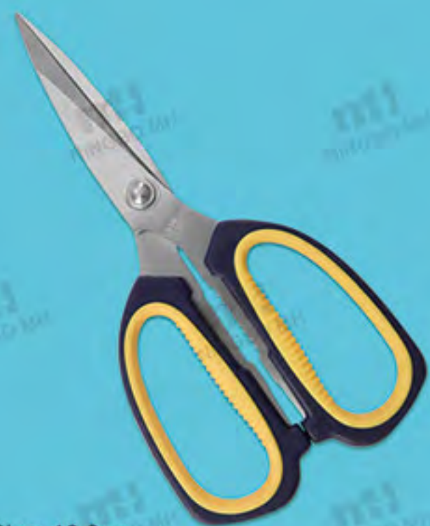
Size: 18.2cm Thickness: 2.3mm Material: PP+TPR Handle