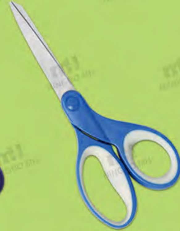
6901-5097 Size: 8"