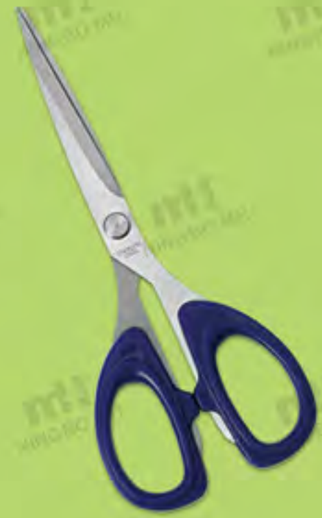
6901-1092A Size: 6.5" Thickness: 2.5mm Material: ABS Handle