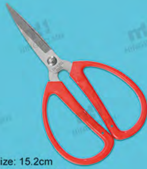
Size: 15.2cm Thickness: 1.8mm Material: PP Handle