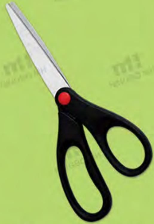
6901-5082 Size: 8"