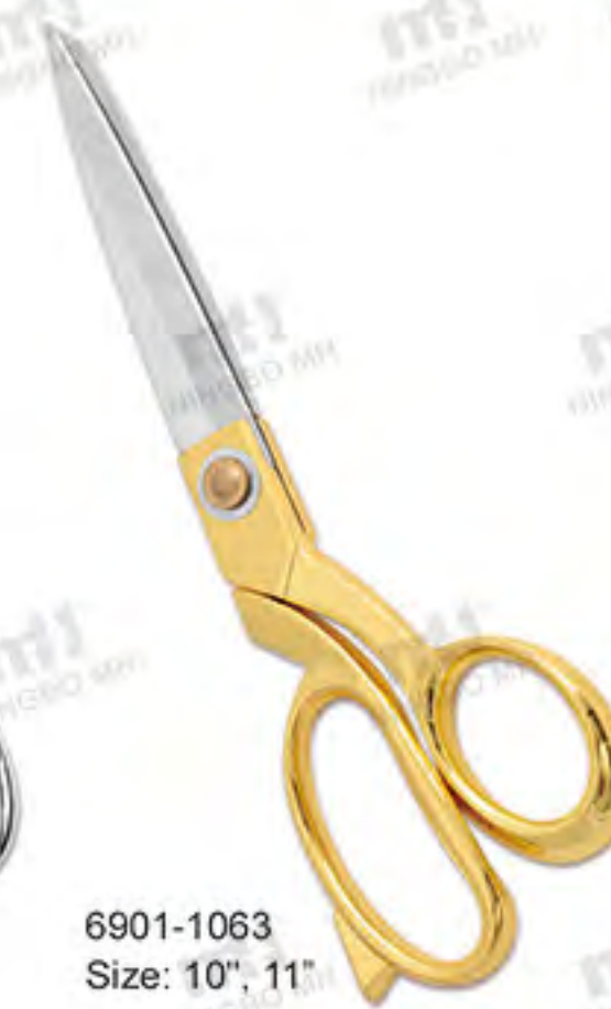
6901-1063 Size: 10", 11"