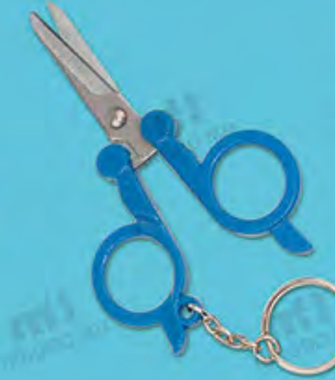
6901-9035 Size: 4"