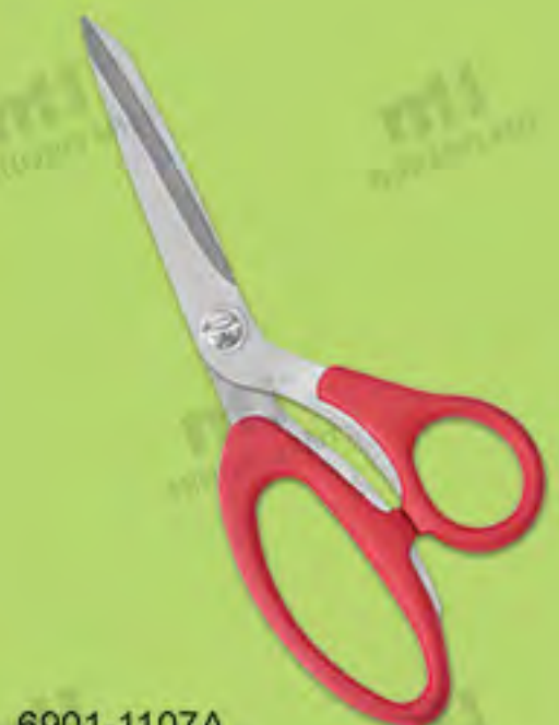
6901-1107A Size: 8.5" Thickness: 3.0mm Material: PP+TPR Handle