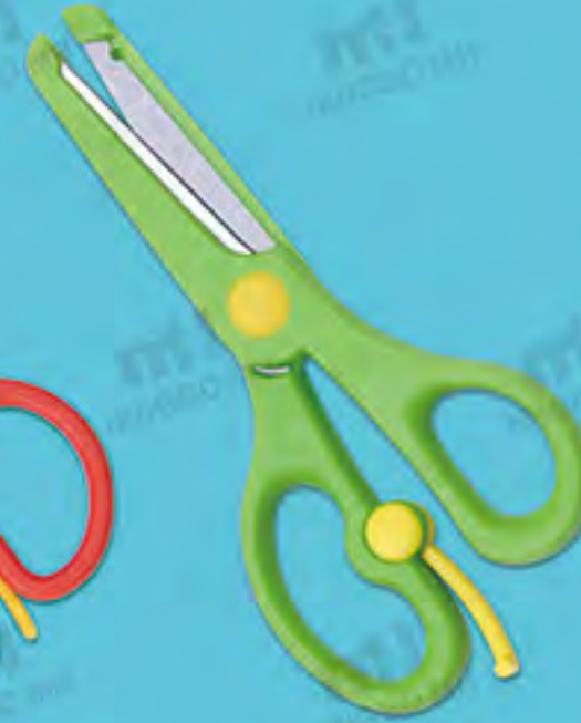
6901-9045 Size: 5.5"