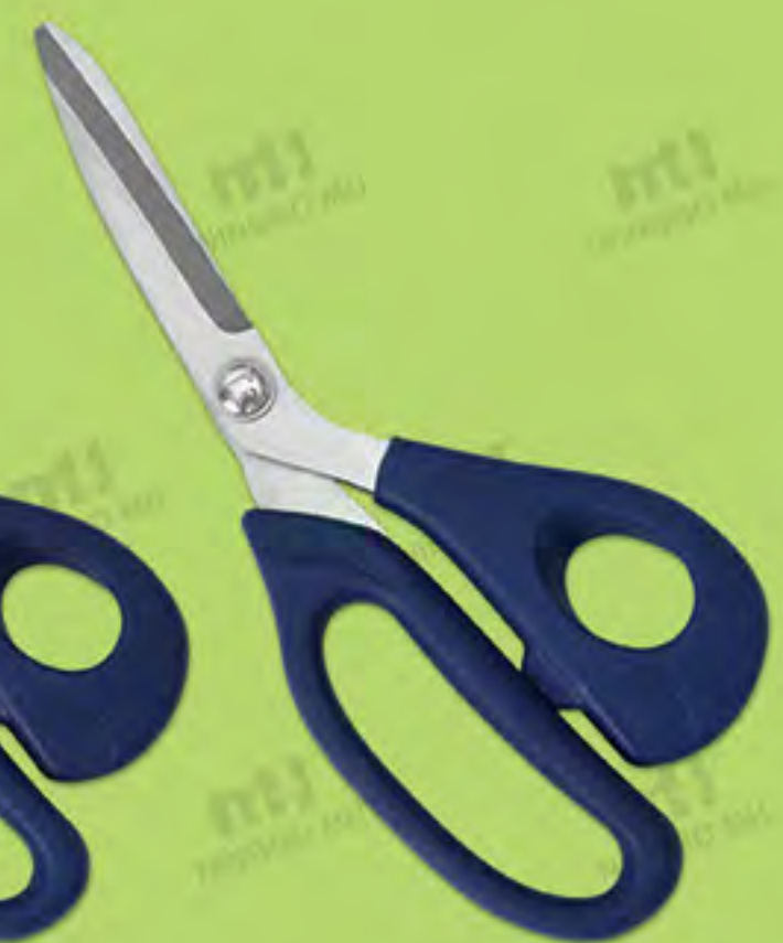
6901-1108 Size: 9" Thickness: 3.5mm Material: PP+TPR Handle