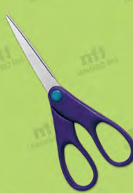
6901-5084 Size: 7"