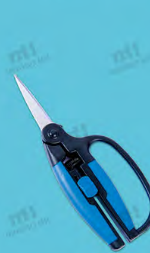
6901-9048 Size: 6"