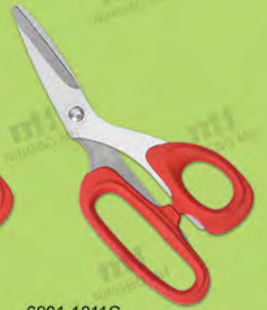
6901-1011C Size: 8.5" Thickness: 3.0mm Material: TPR Handle