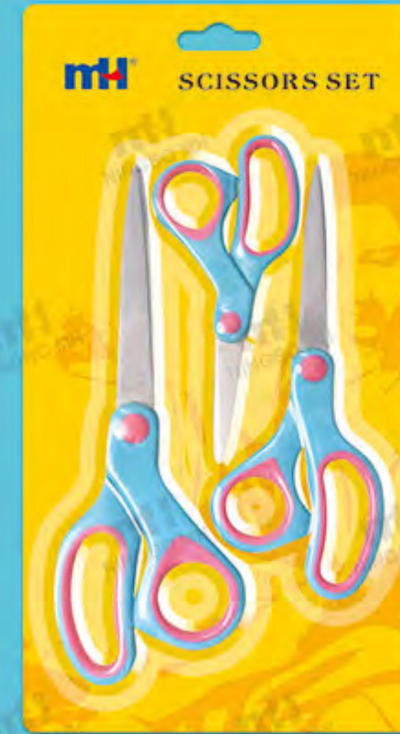
6901-6007 Size: 5"+7"+8"