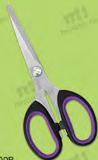
6901-5100B Size: 6" Thickness: 1.8mm Material: PP+TPR Handle