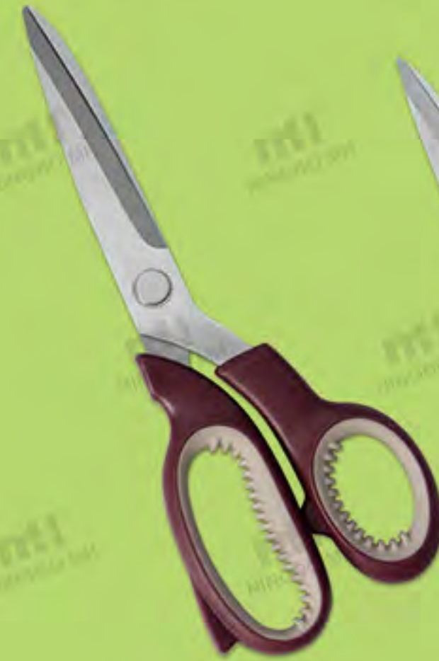
6901-1109 Size: 10" Thickness: 3.3mm Material: PP+TPR Handle