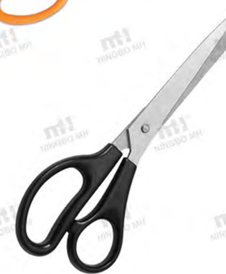
6901-5095 Size: 7.5"