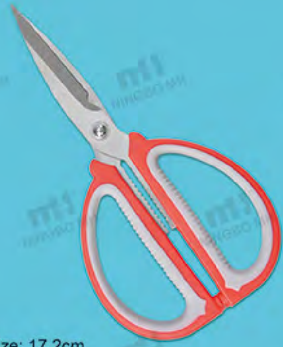
Size: 17.2cm Thickness: 3.0mm Material: PP+TPR Handle