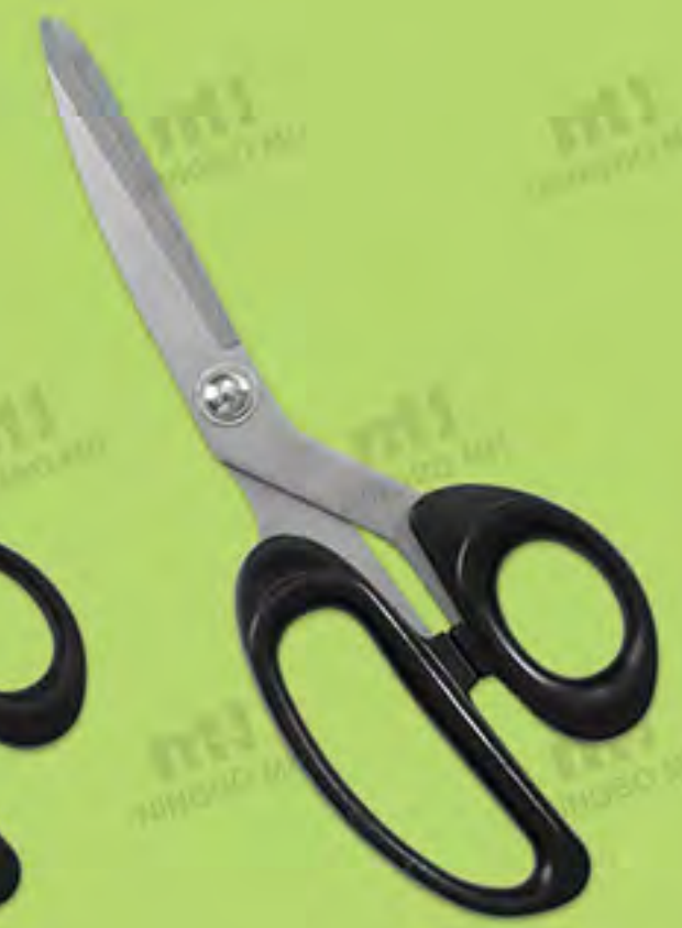
6901-1096A Size: 8.5" Thickness: 2.0mm Material: PP Handle