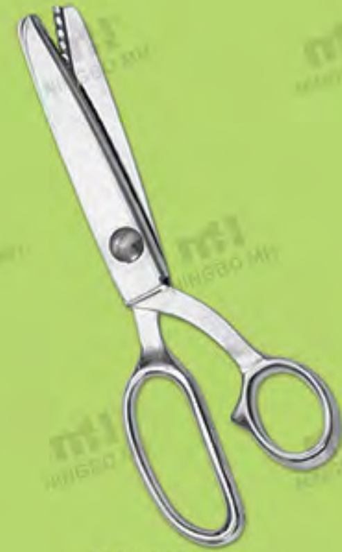
6901-3028 Size: 9"