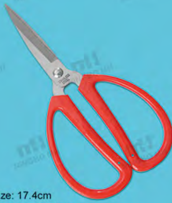
Size: 17.4cm Thickness: 2.0mm Material: PP Handle