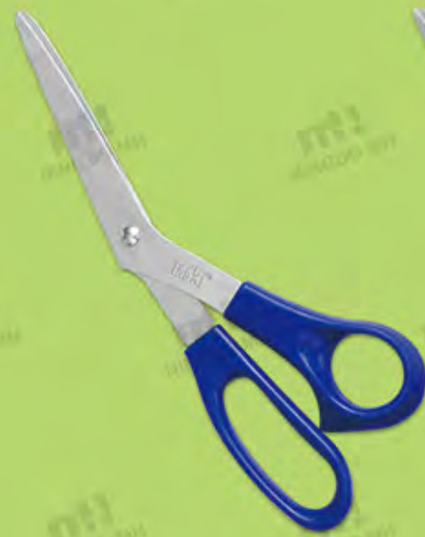
6901-5023 Size: 8.5"