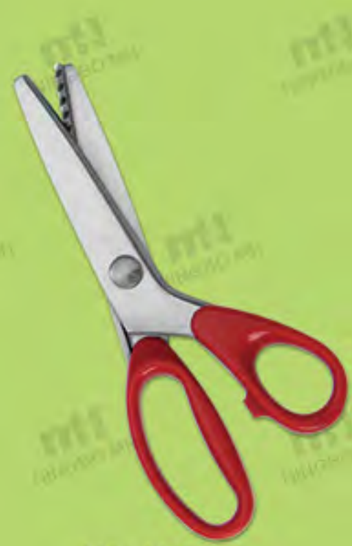
6901-3017 Size: 7"