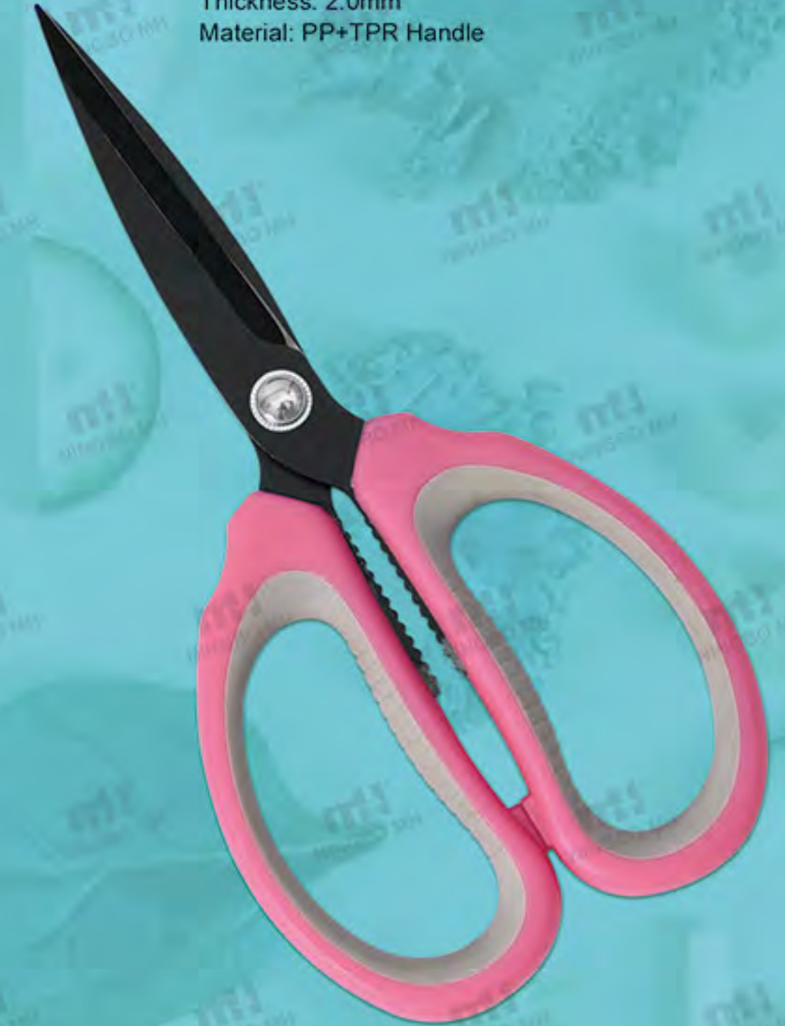
6901-9066 Size: 19.6cm Thickness: 2.0mm Material: PP+TPR Handle