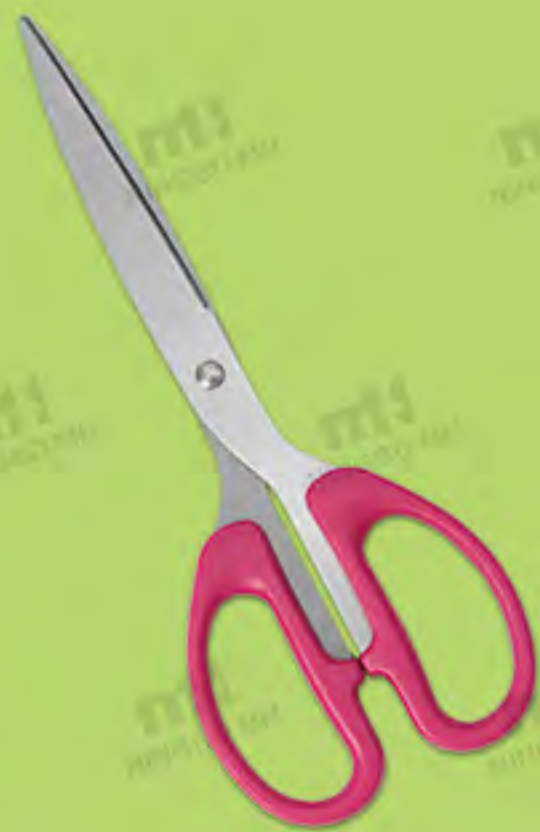
6901-5042 Size: 8" Thickness: 2.8mm Material: ABS Handle