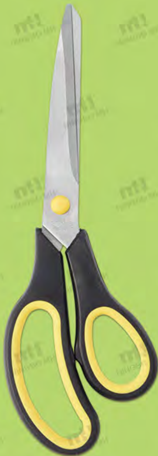
6901-5009G Size: 9.75" Thickness: 2.5mm Material: PP+TPR Handle