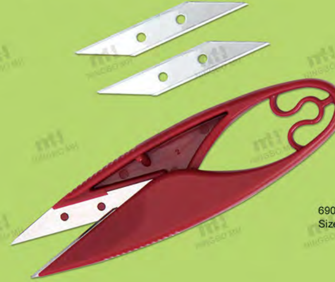
6901-4027 Size: 11cm