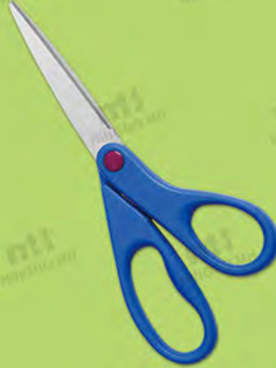
6901-5083 Size: 8"