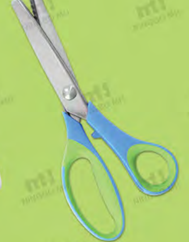
6901-3029 Size: 9"