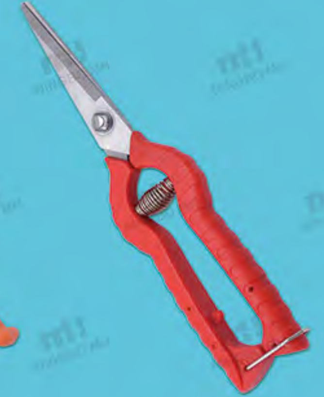
6901-9051 Size: 8"