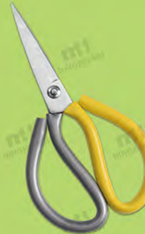
6901-9063B Size: 9"