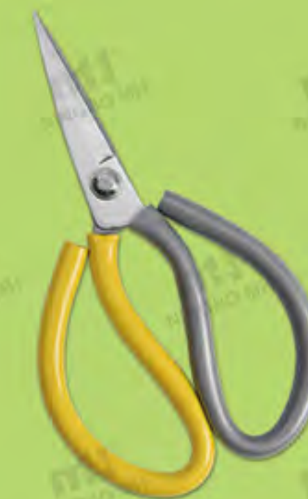
6901-9063 Size: 7.5"