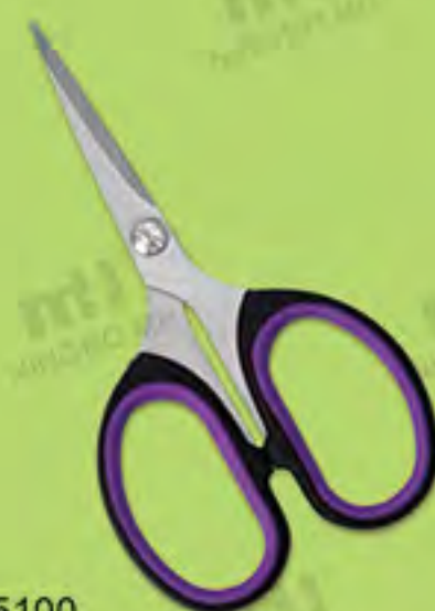
6901-5100 Size: 4.5" Thickness: 1.7mm Material: PP+TPR Handle