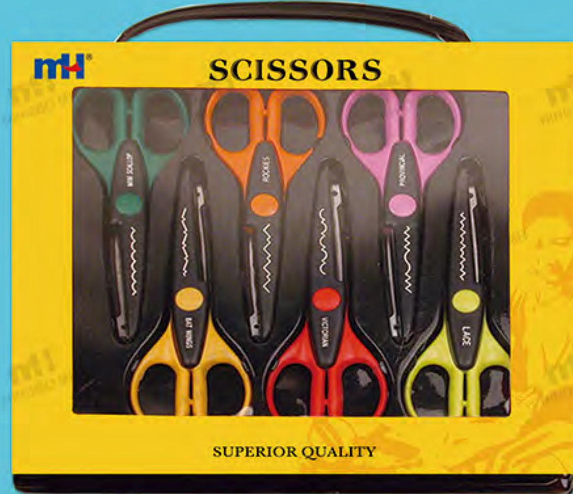
6901-6001 Size: 6"*6pcs