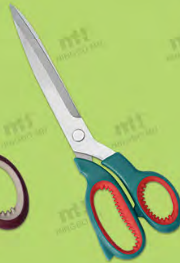
6901-1109A Size: 9" Thickness: 3.3mm Material: PP+TPR Handle