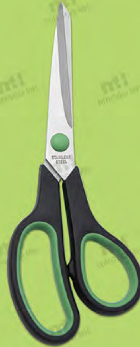
6901-5009C Size: 7.5" Thickness: 1.6mm Material: PP+TPR Handle