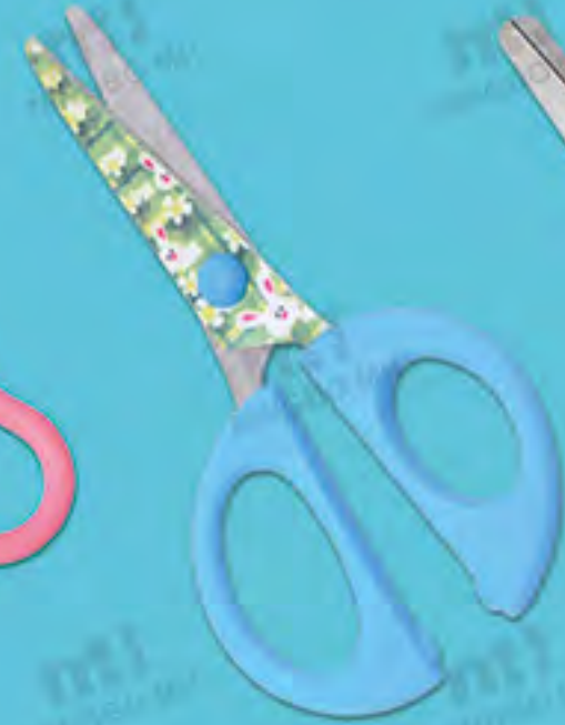
6901-9043 Size: 5"