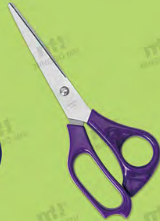
6901-5098A Size: 7"