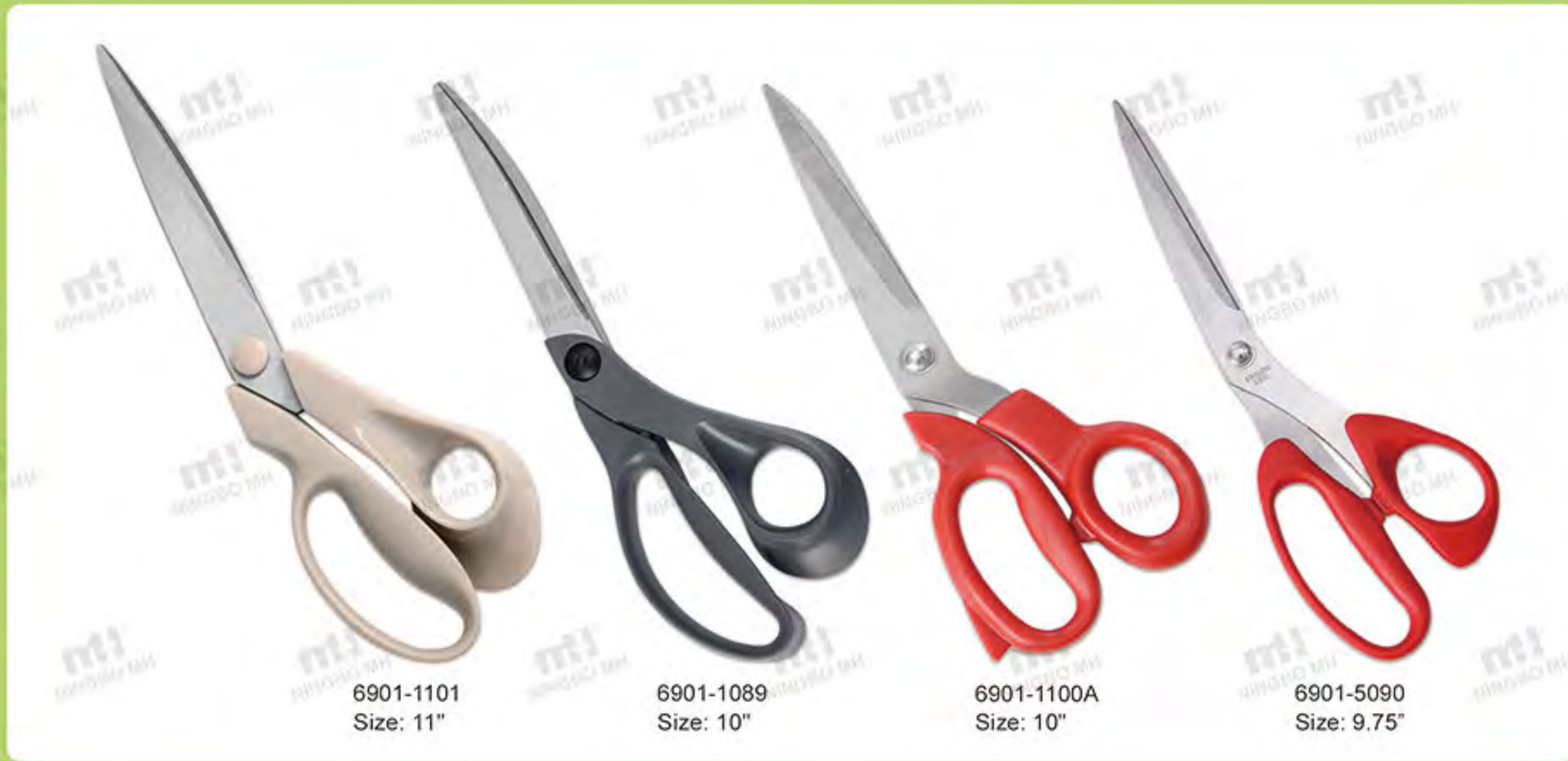
6901-1101 Size: 11"