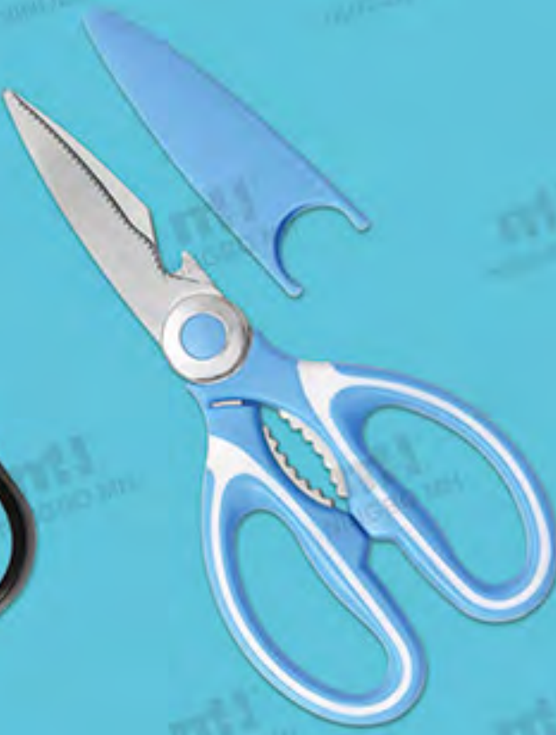
6901-9089 Size: 8.5"