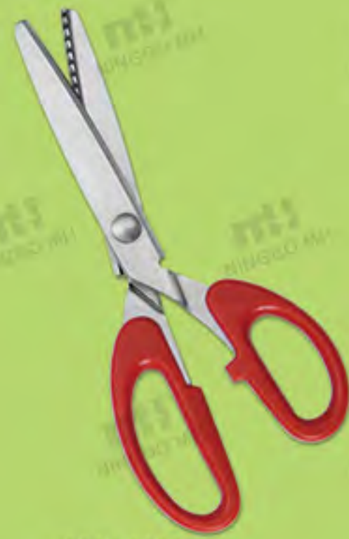
6901-3026 Size: 8.5"