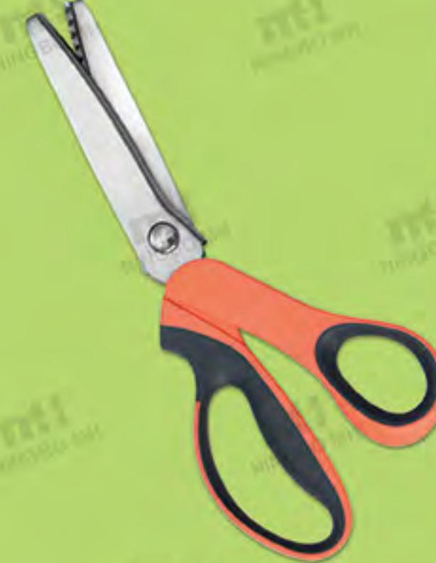
6901-3015B Size: 9.25"