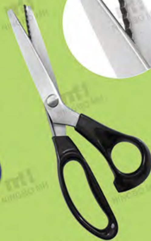
6901-3004 Size: 9"