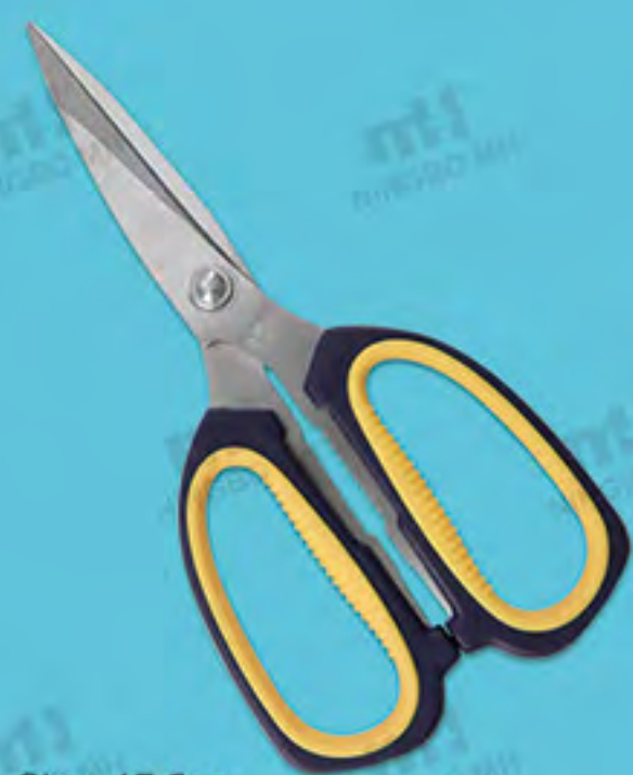
Size: 17.5cm Thickness: 2.3mm Material: PP+TPR Handle