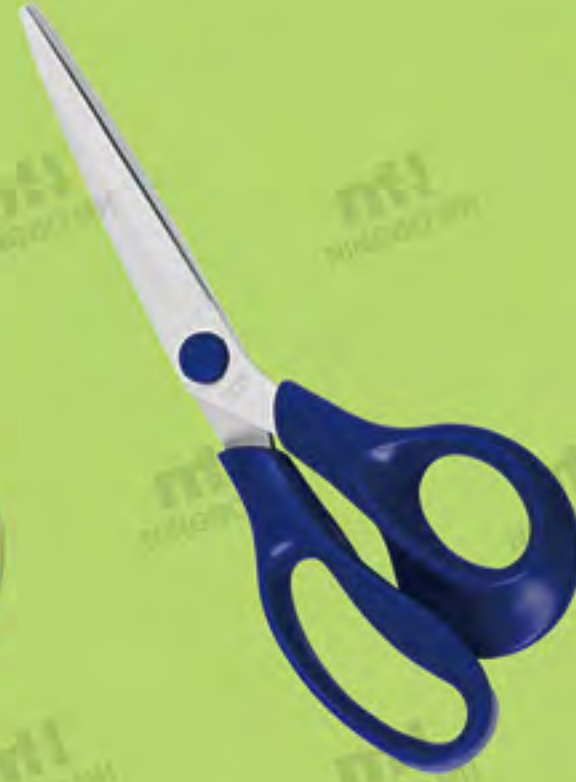
6901-5007 Size: 8.5"