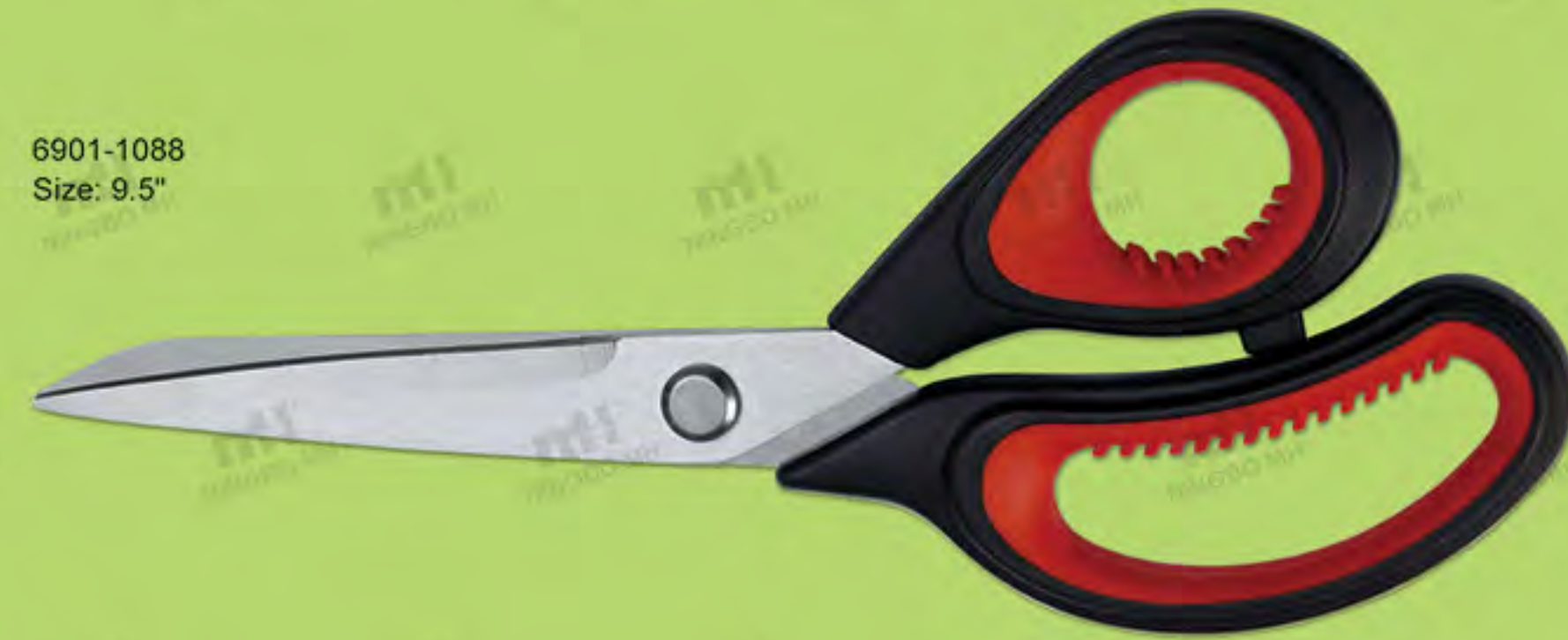
6901-1088 Size: 9.5"