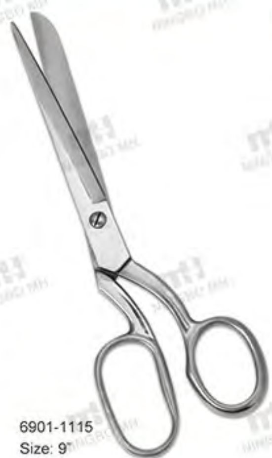
6901-1115 Size: 9"