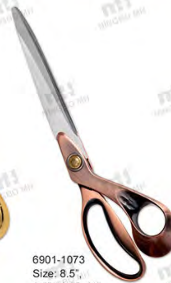
6901-1073 Size: 8.5", 9.5", 10.5", 11"