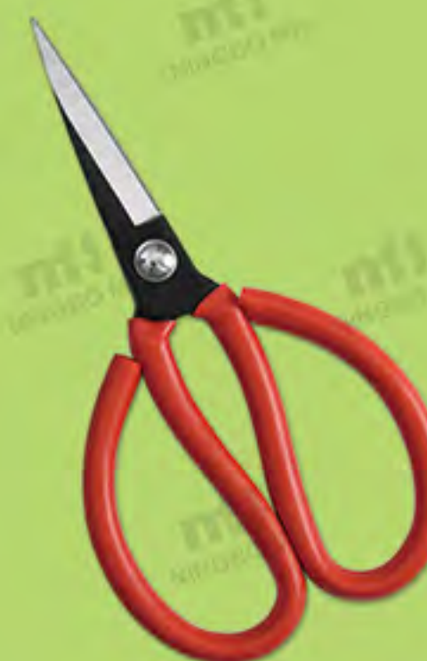
6901-9046 Size: 8"