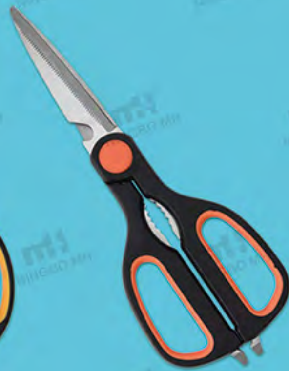
6901-9076 Size: 9"