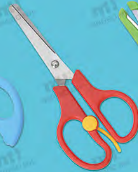
6901-9061 Size: 5.5"