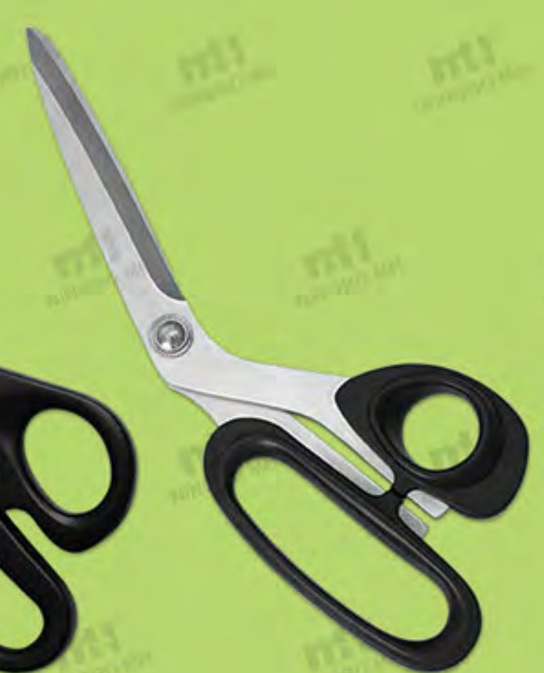
6901-1105 Size: 9.25"