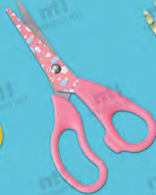
6901-9082 Size: 5.5"