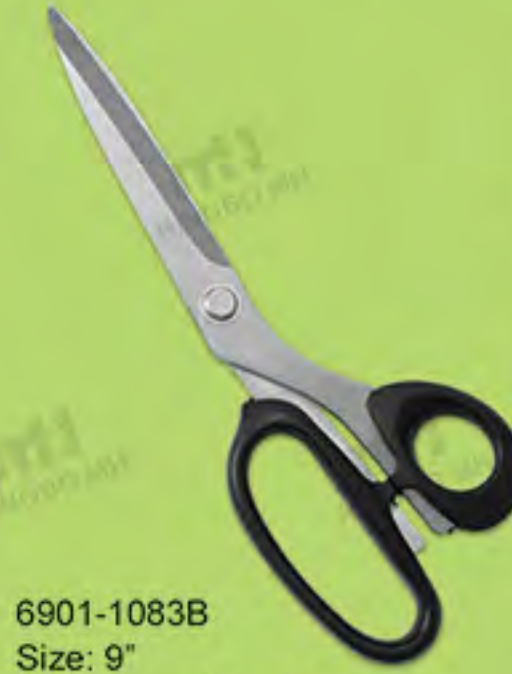
6901-1083B Size: 9" Thickness: 2.5mm Material: PP Handle