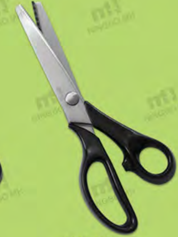
6901-3007 Size: 8.75"