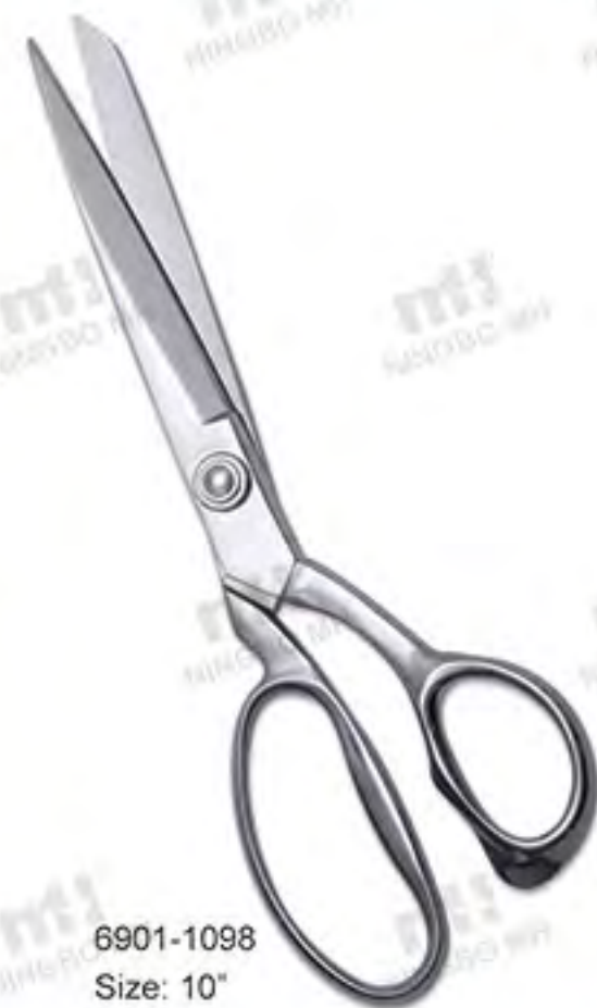
6901-1098 Size: 10"