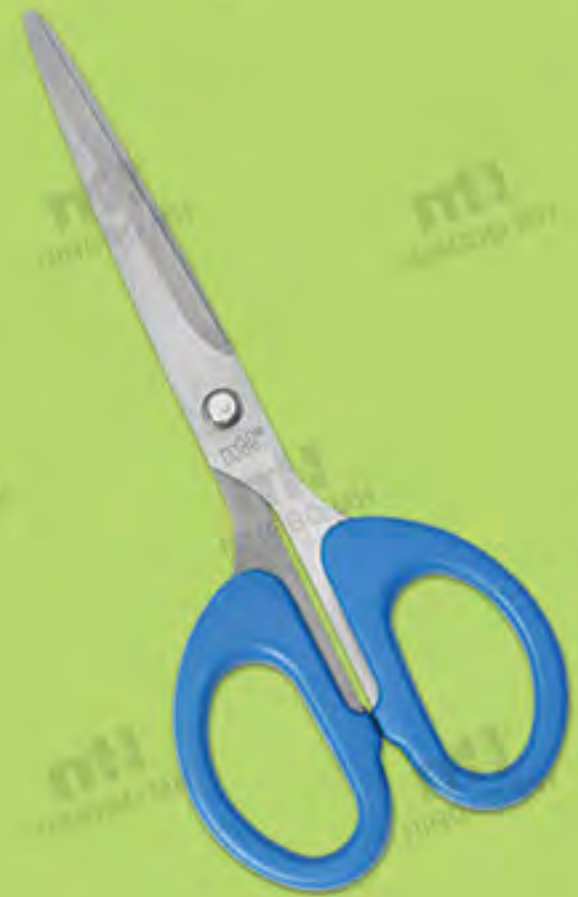
6901-5042A Size: 8.5" Thickness: 2.5mm Material: ABS Handle