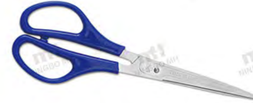
6901-5040 Size: 6.5"