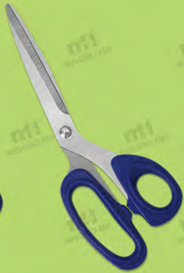
6901-1092C Size: 9" Thickness: 3.0mm Material: ABS Handle