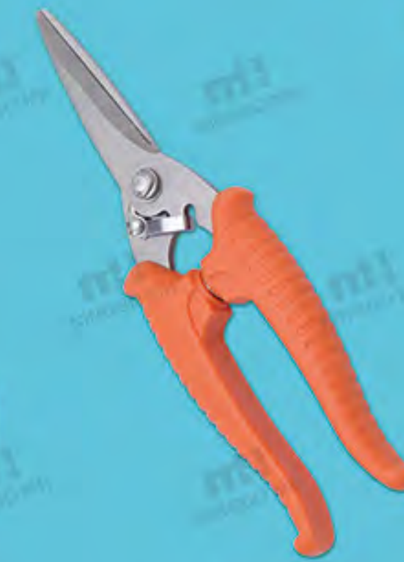
6901-9050 Size: 8"