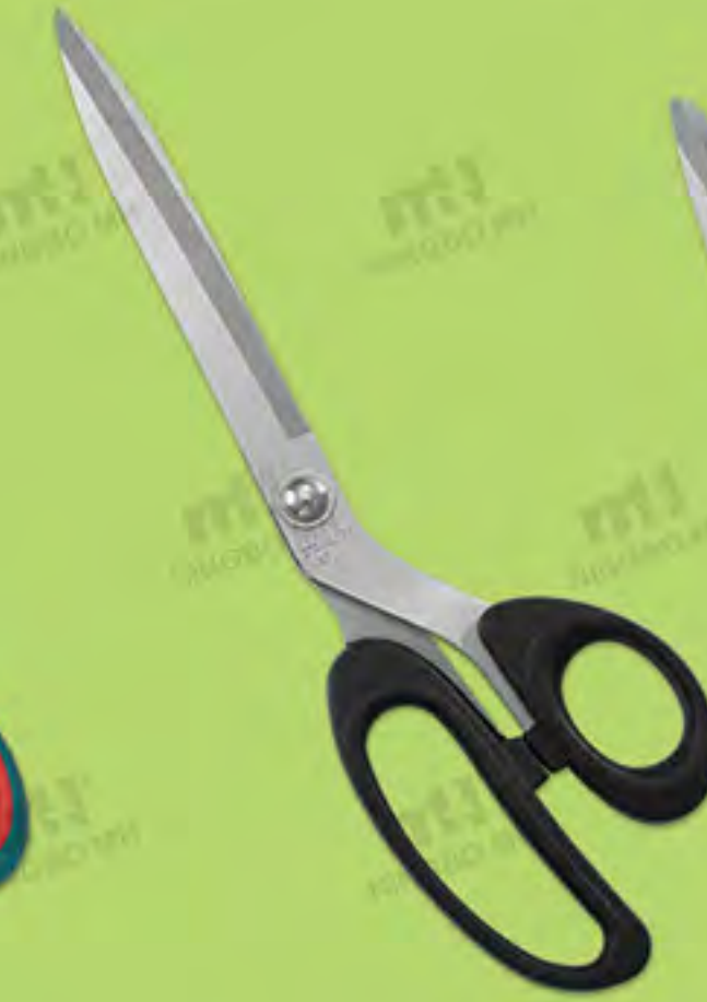
6901-1096 Size: 9.5" Thickness: 2.0mm Material: PP Handle