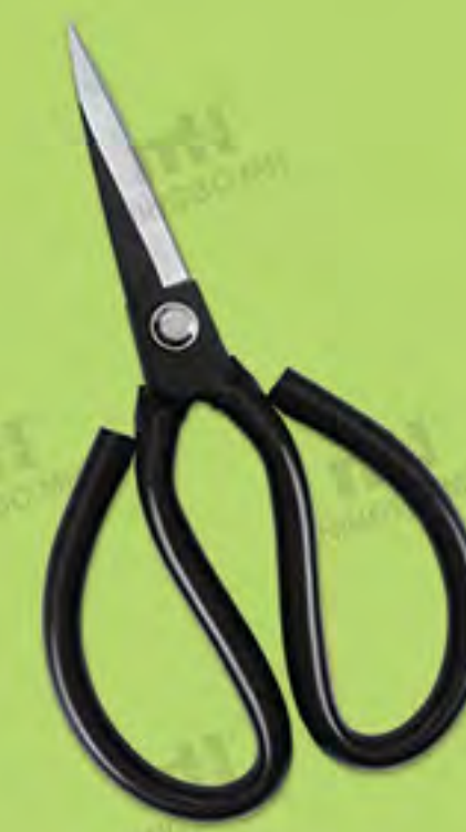
6901-9022 Size: 7.75"