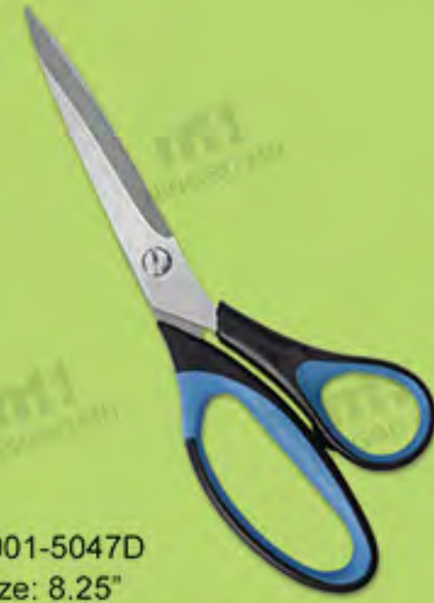
6901-5047D Size: 8.25" Thickness: 2.3mm Material: PP+TPR Handle