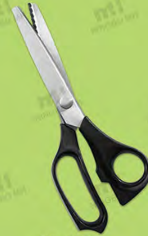
6901-3009 Size: 8.5"