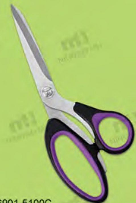
6901-5100C Size: 8.5" Thickness: 3.0mm Material: PP+TPR Handle