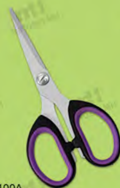
6901-5100A Size: 5.75" Thickness: 1.6mm Material: PP+TPR Handle