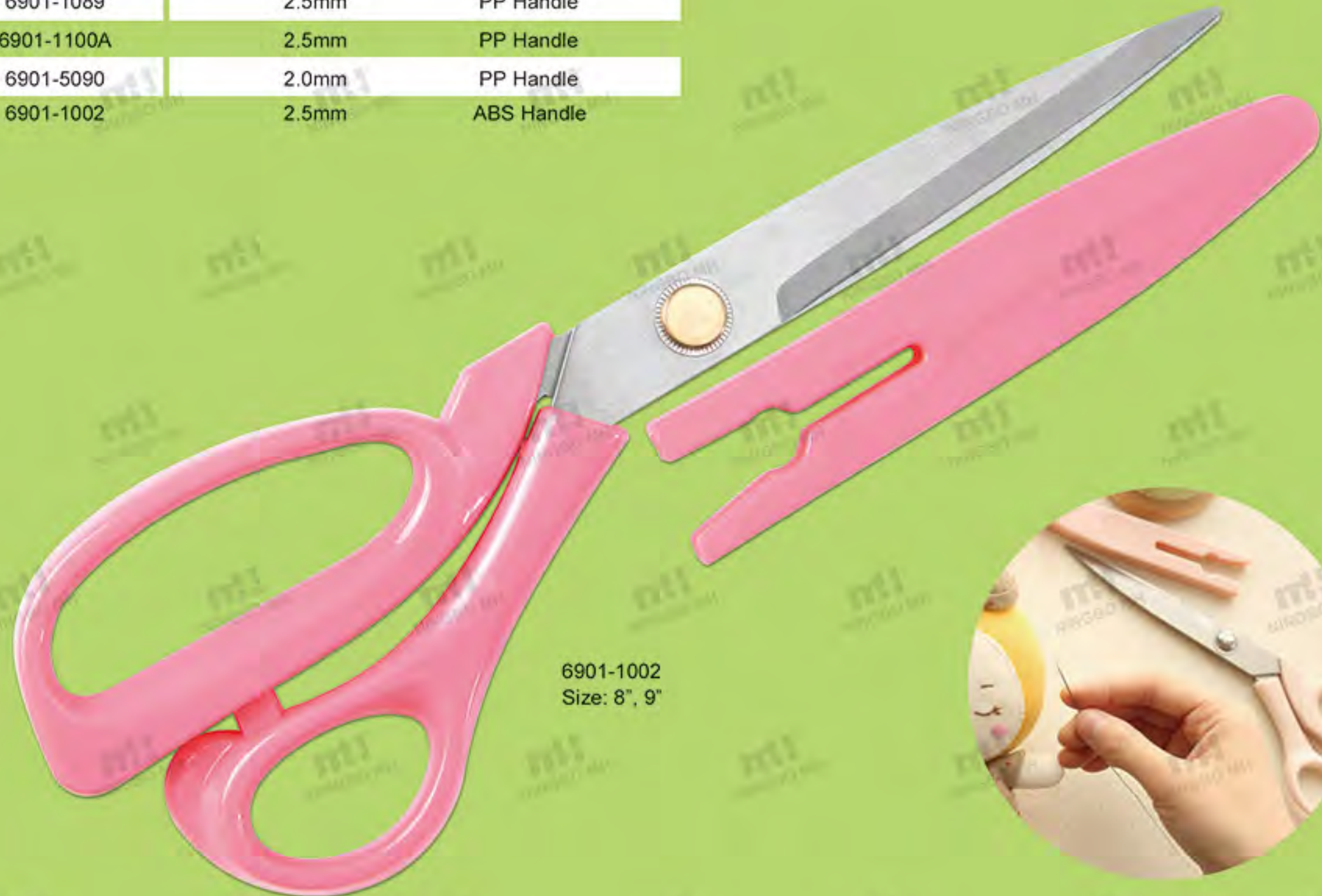
6901-1002 Size: 8", 9"