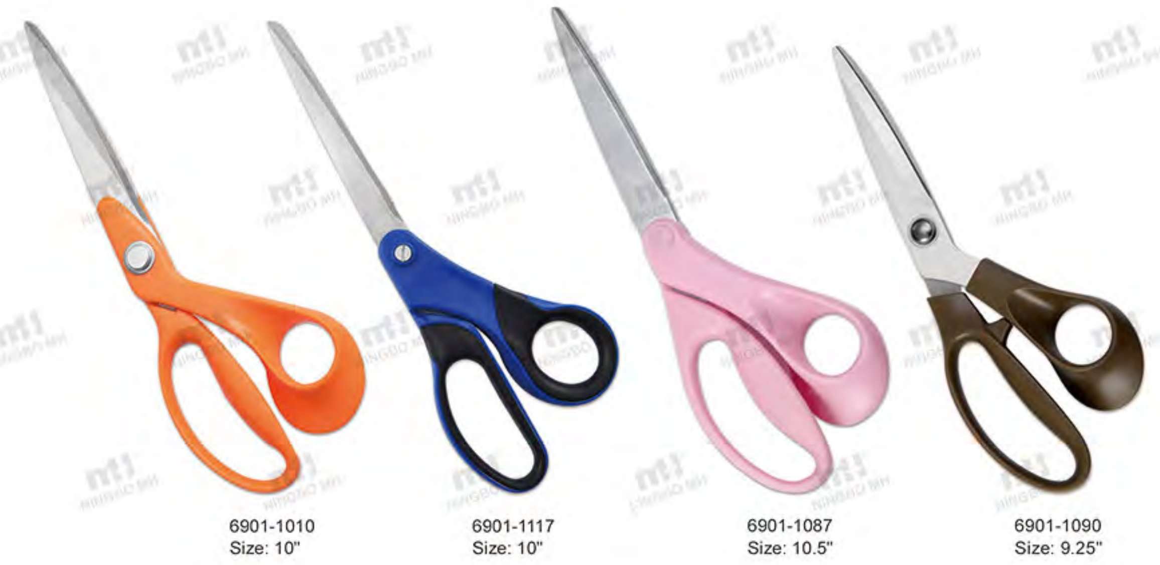
6901-1010 Size: 10"