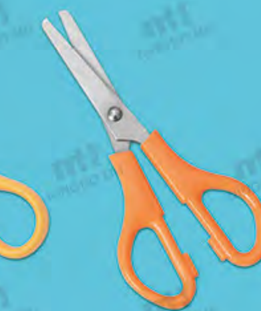
6901-9062 Size: 5"