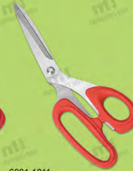
6901-1011 Size: 9" Thickness: 3.0mm Material: TPR Handle