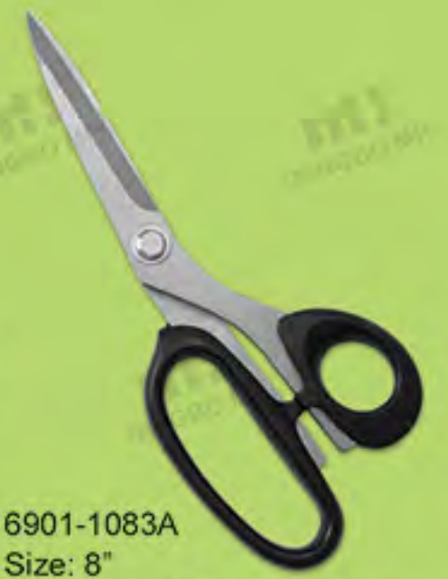
6901-1083A Size: 8" Thickness: 2.5mm Material: PP Handle