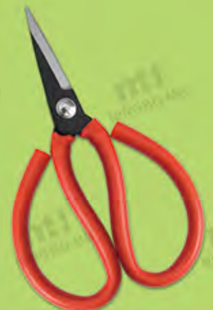
6901-9046B Size: 5.5"