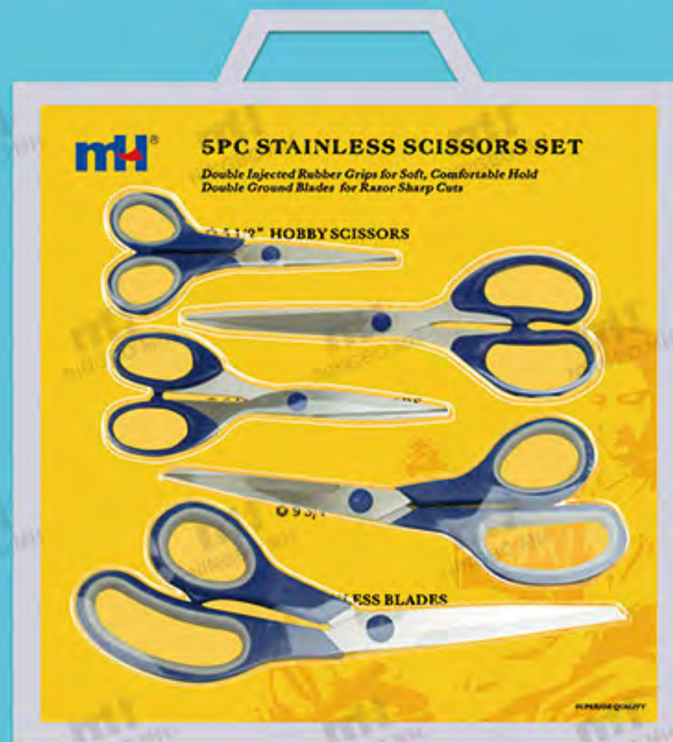
6901-6002 Size: 5.5"+6"+7"+8.5"+9.75"