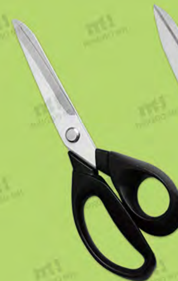
6901-1015 Size: 8.25"