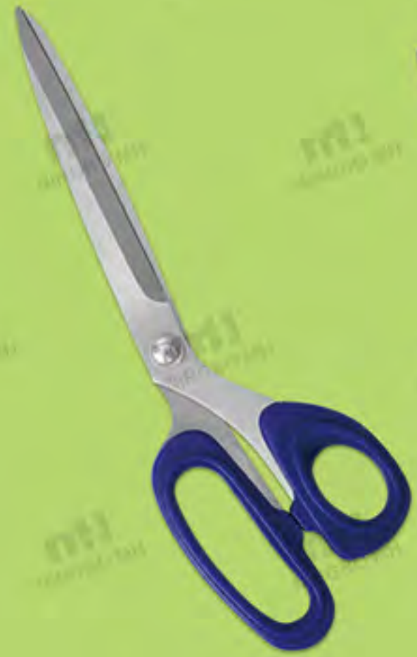
6901-1092D Size: 10" Thickness: 3.0mm Material: ABS Handle