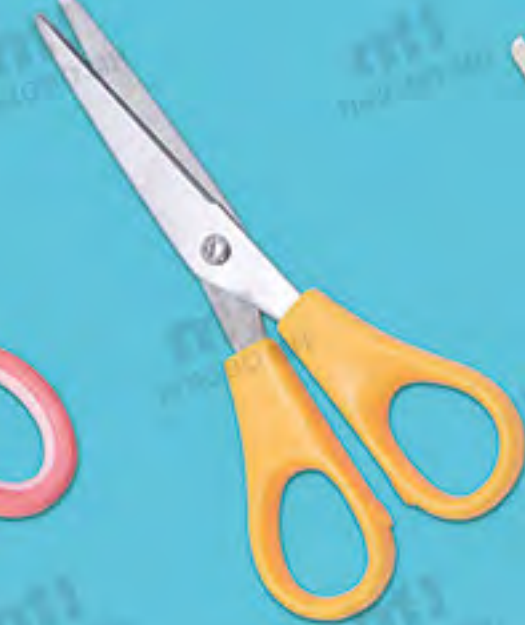
6901-9008 Size: 5.5"