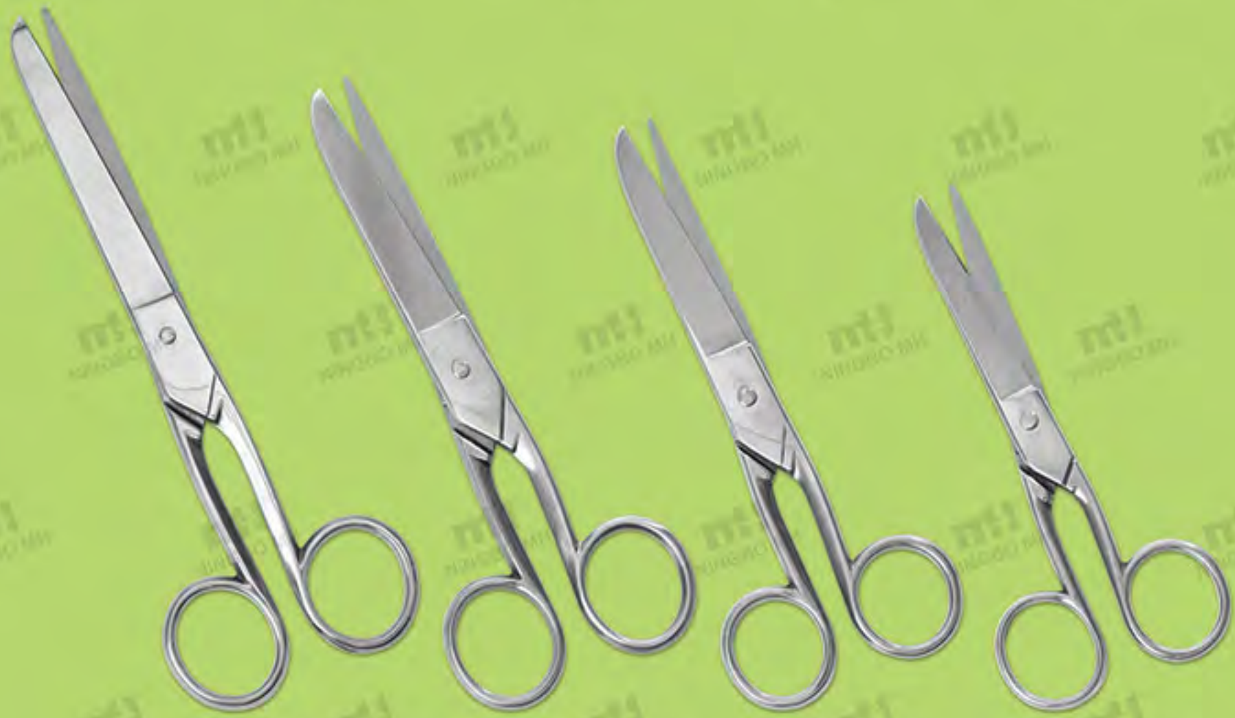
6901-5073C Size: 8"