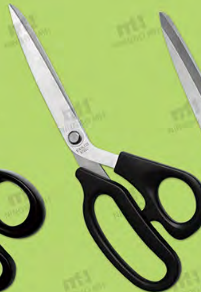
6901-1014 Size: 9.5"