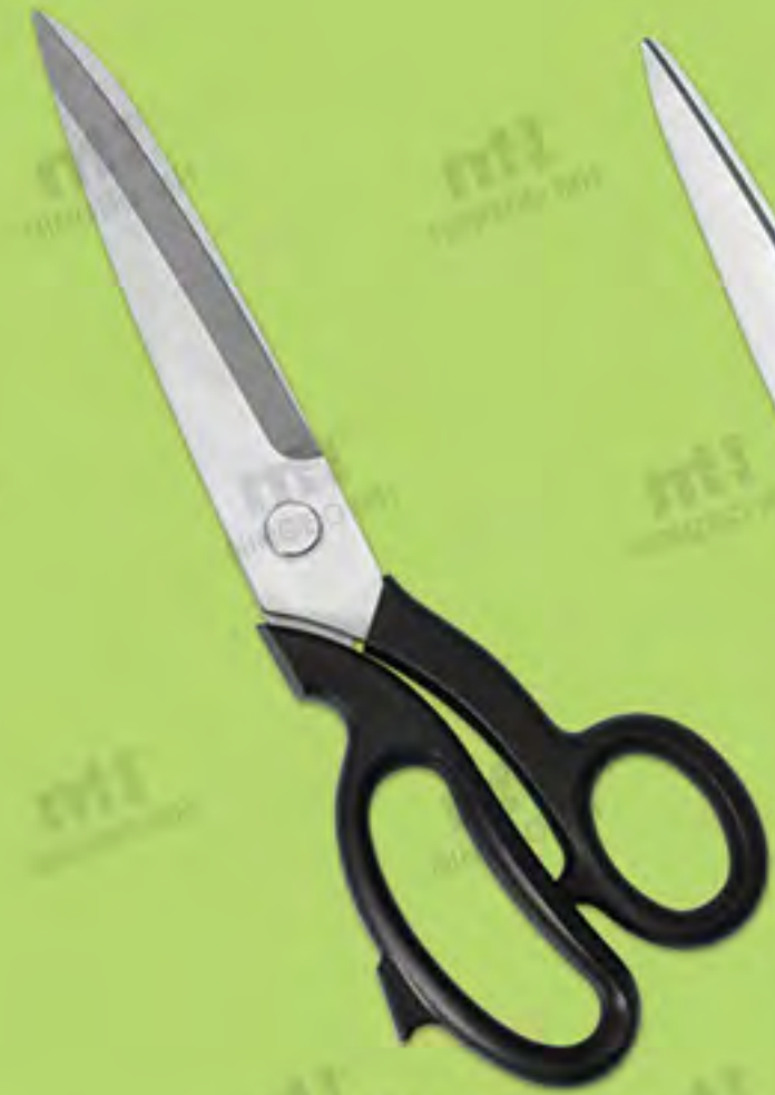
6901-1110A Size: 11"