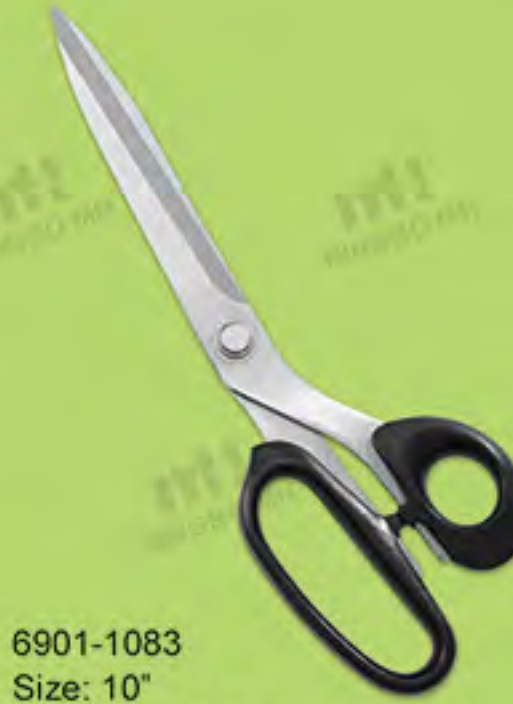
6901-1083 Size: 10" Thickness: 2.5mm Material: PP Handle