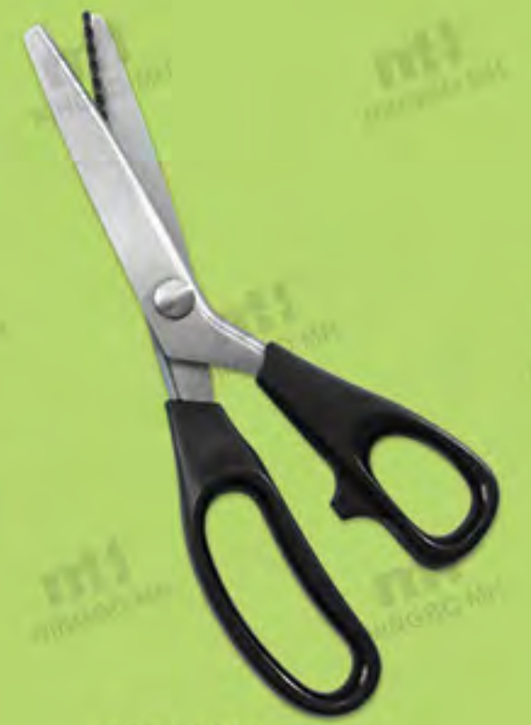
6901-3006 Size: 9"