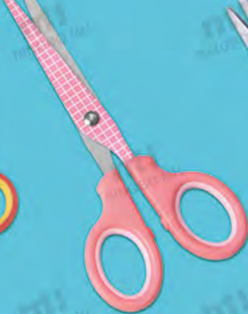
6901-9083 Size: 6.25"