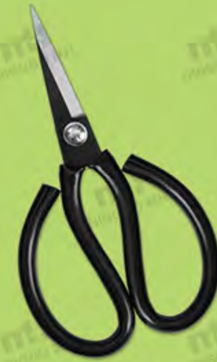
6901-9022D Size: 7"