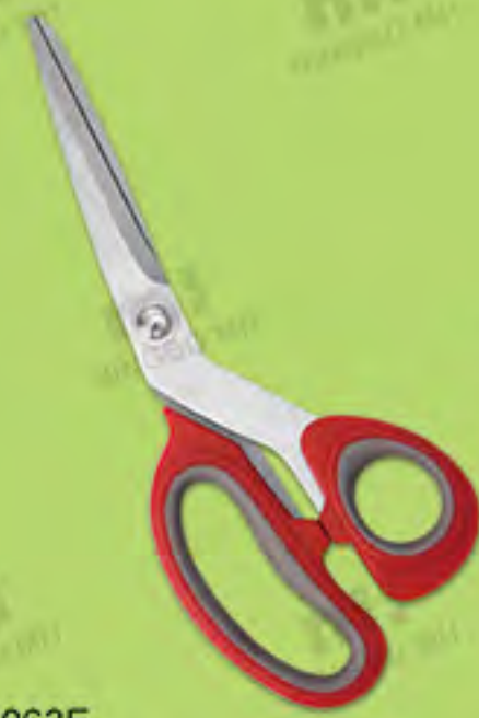
6901-5063E Size: 8.25" Thickness: 2.5mm Material: PP+TPR Handle