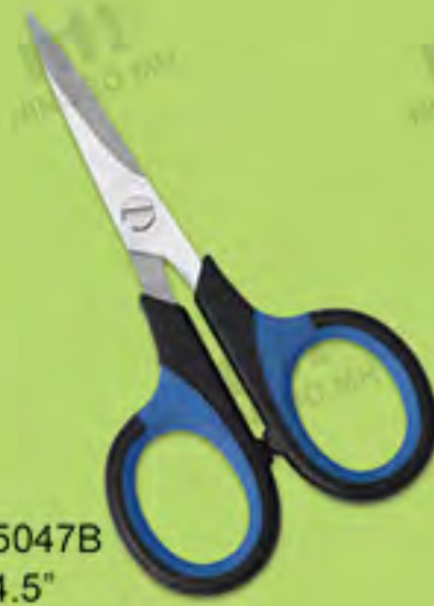
6901-5047B Size: 4.5" Thickness: 1.3mm Material: PP+TPR Handle