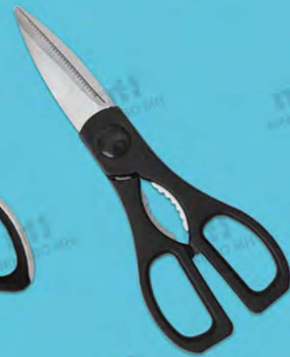
6901-9072 Size: 8"